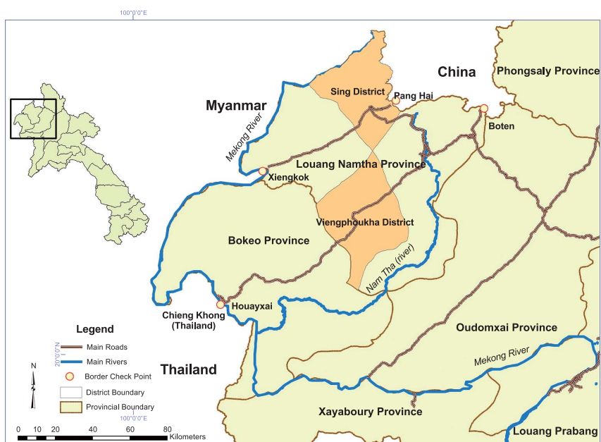
Fig. 1 Map of Northwest Laos and Research Site (Sing and Viengphoukha Districts)