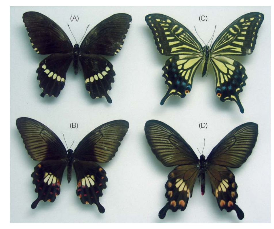
Fig 1. Females of three butterfly species/morphs. (A) Papilio polytes, cyrus form (nonmimetic). (B) Papilio polytes, polytes form (mimetic). (C) Papilio xuthus. (D) Pachliopta aristolochiae.

We used three species of Papilioninae, Papilio polytes (Papilionini) (Fig. 1A, B), Pachliopta aristolochiae (Troidini) (Fig. 1D), and Papilio xuthus (Papilionini) (Fig. 1C). Papilio polytes is a palatable swallowtail butterfly commonly found throughout the Oriental tropics. Males of this butterfly are monomorphic, whereas females are polymorphic. Pachliopta aristolochiae is an unpalatable toxic butterfly also found throughout the Oriental tropics. It has red warning spots on the hindwings. Poisonous substances are absorbed from the food plant by the larva and stored by the organism during pupation and metamorphosis (Euw et al., 1968). Papilio xuthus , which is not known to be involved in mimicry either as a model or as a mimic, is a swallowtail butterfly found throughout temperate