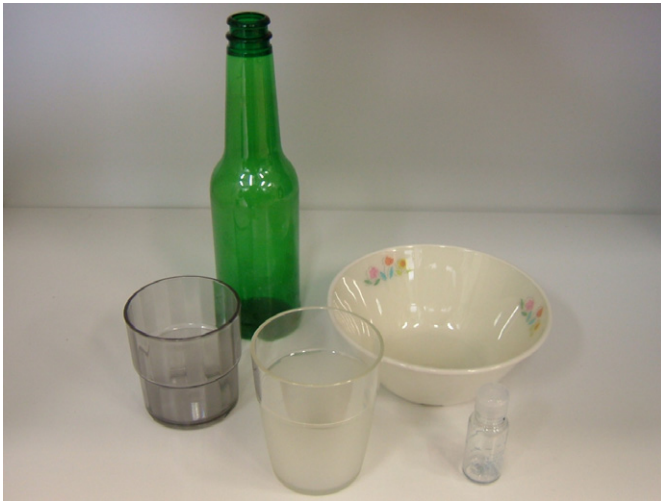
Fig. 1: Photograph of a dinner set composed of polyethylene naphthalate.