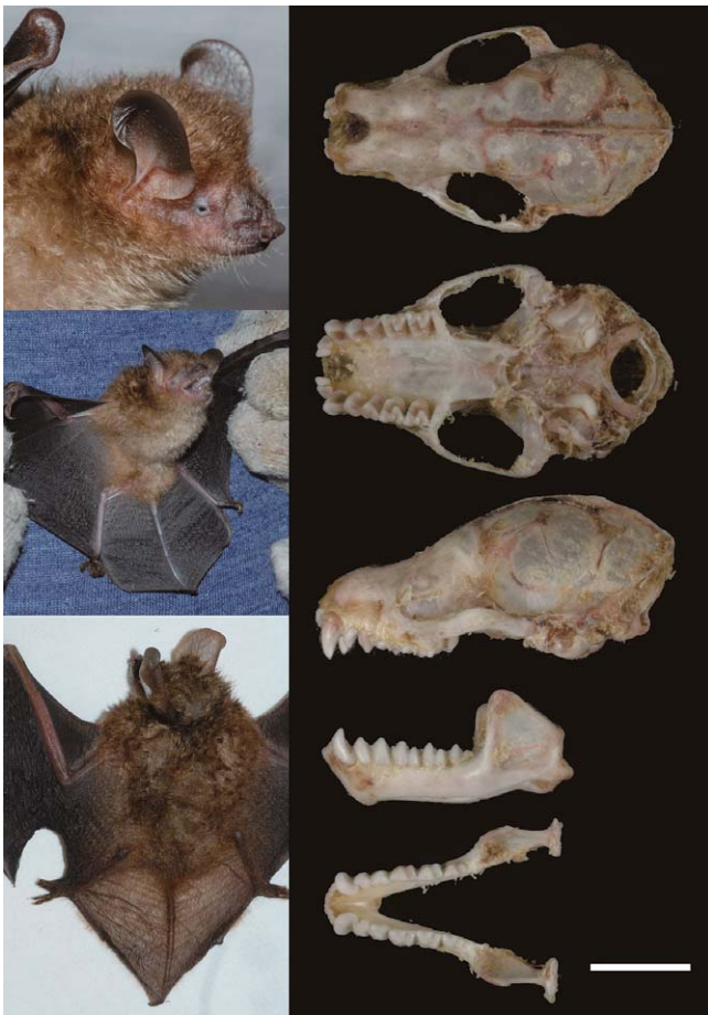
Fig. 1. External features (left) and skull (right) of Murina harrisoni from Hainan Island, China (IBHG 08295). Bar on the skull photo indicates approximately 5 mm.

without an emargination on the posterior border. The tragus is bent slightly backward. The tail membrane and the back of the foot are evenly furred above, and the last vertebra is free from the uropatagium. The plagioptagium is attached to the base of the first toe.