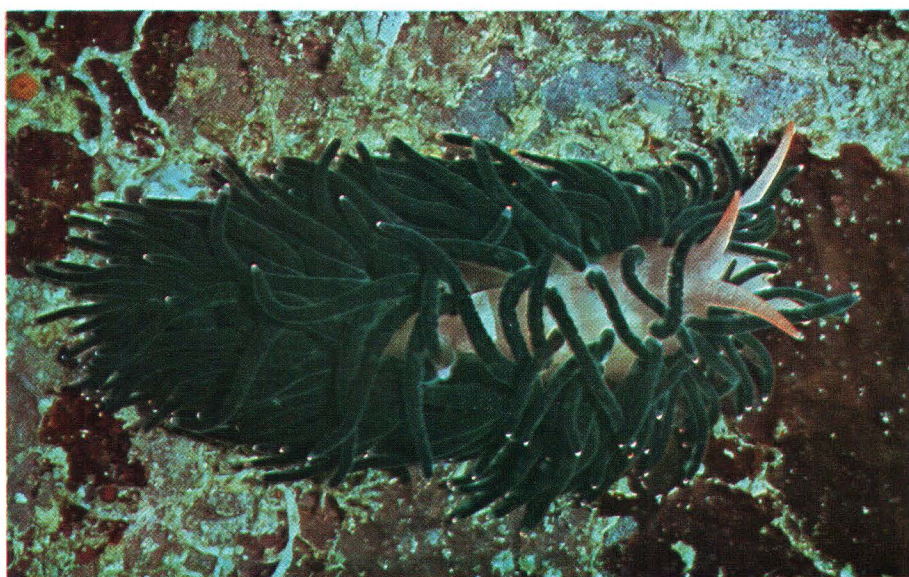
Fig. 2. Phestilla melanobrachia BERGH, black individual feeding on Tubastraea diaphana , Singapore.