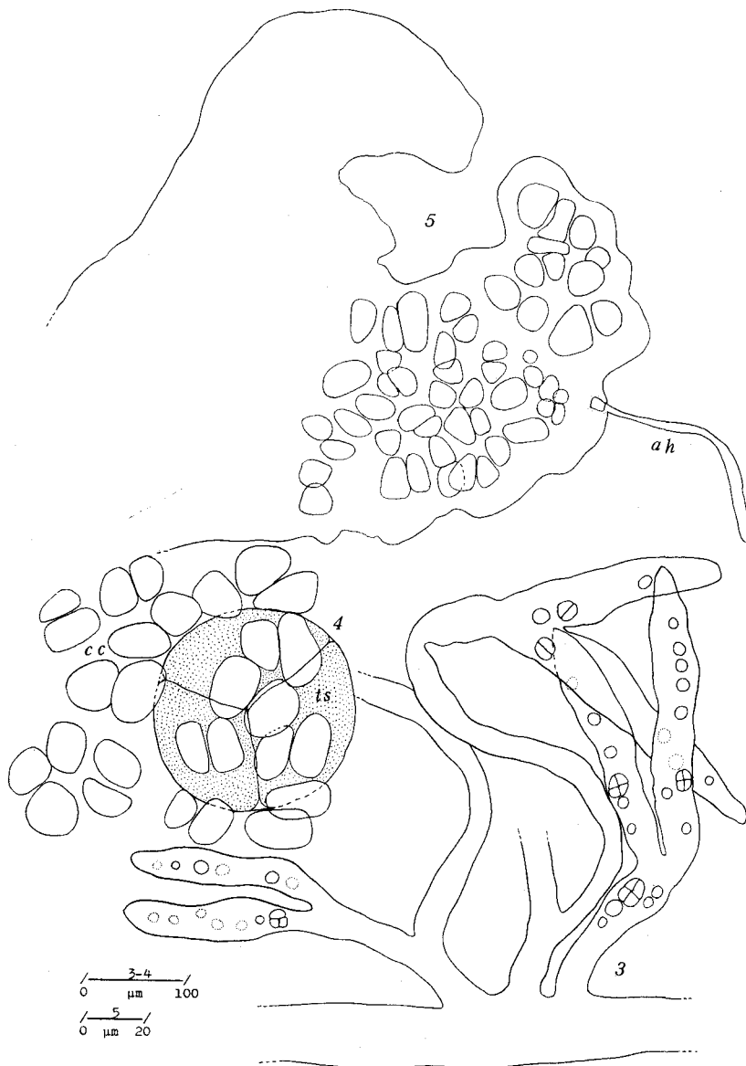
Figs. 3-4. Ceramium howei Weber van Bosse

A comparison with the original description of Weber van Bosse (1923) as well as an examination of the beautifully illustrated Vietnamese plant of Tanaka and Pham-Hoang (1962), shows some similar features with the plants at hand. Some of