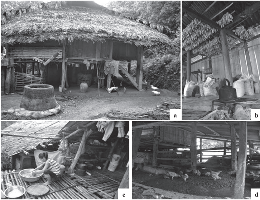
Fig. 2 Traditional Cao Lan Style House and Components; (a) Cao Lan House, Well, and Courtyard, (b) Fire-place inside the House, (c) Balcony, (d) Animal Pens under the House

and heating. The ancestral shrine is mounted on a side wall of the house. Agricultural products such as rice grain and dried maize are stored inside the house. Some houses have large attached balconies built from bamboo where they do laundry and sun-dry food (Fig. 2).