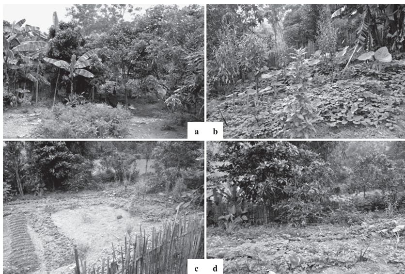
Fig. 3 Homegardens of the Cao Lan of Cao Ngoi Village; (a) Organic, Multi-level and Overlapping Canopy, (b) Polycentric and Multi-species, (c) Indeterminate Boundary, (d) Multi-level and Multi-species

(88%) having 5 levels. More than half (56%) of the gardens have more than 50% of their planting area covered by overlapping vegetation layers.