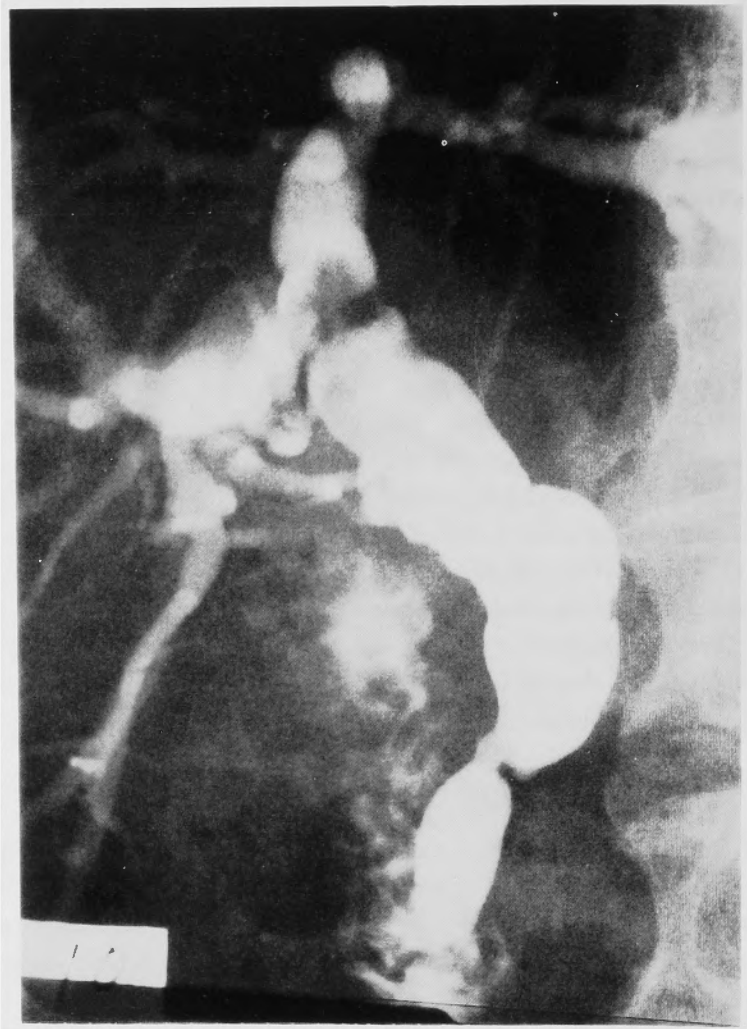
Fig. 1. Endoscopic retrograde cholangiogram showing the stricture at the lower common bile duct and filling defects in the biliary ductal system. Gallbladder is non-opacified.

(Fig. 1) Gallstones or debris were suspected concerning these filling defects.