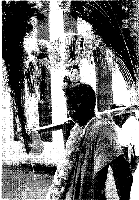
Fig. 2. Kāvati

who traveled South India during the last half of 18th century left records regarding fire walking, kāvati , and hook swinging 9 . Prior to that is the following account of fire walking by Dubois in the mid 18th century 10 .