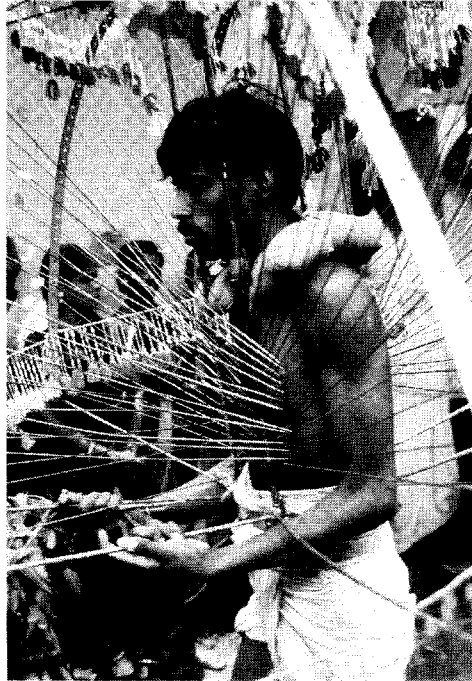
Fig. 3. Spiked Kāvati

Kāvati is a typical votive ritual in which people carry a balancing pole decorated with peacock feathers on their shoulders and worship at the temple while dancing in a state of trance (Fig. 2). Kāvati is based on a myth of a demon (Asura). Once upon a time, an Asura was carrying two hills on a balancing pole and was killed for provoking the anger of the god Murugan. However, by Murugan's mercy he was resurrected and came to be accepted as a faithful devotee. This ritual is accompanied by pain-inflicting actions such as inserting fine skewers into the body (Fig. 3) and piercing hooks on the shoulders 12 . The skewers are in the shape of the weapons carried by the god Murugan. In this way, the devotees liken themselves to the Asura and are killed by the god; and as in the myth, they are resurrected. Here also, we come across the theme of death and regeneration.