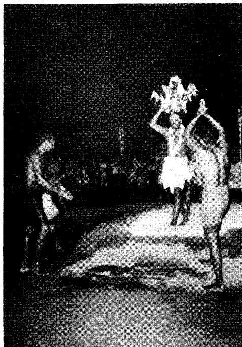
Fig. 1. Fire Walking

fire walking is performed on the hot ashes that remain. The distance of the walk is approximately five meters. The first to walk is the medium in a state of trance (Fig. 1). He walks to the end where an image of the goddess is placed. Other devotees follow after he has finished. Some men run across the fire out of fear, but there are some who proceed with firm steps and have just as much confidence as the medium. I will omit the details of the fire walking ritual here, but it can be interpreted that the medium is a sacrificial victim offered to the goddess. The medium is like the village goat, and crosses the fire as the sacrificial victim for the village. He is followed by the devotees who come to accomplish their vows. They can be regarded as parallel to the goats and roosters that are offered after the offering of the village goat. The devotees “die” in the fire and are regenerated by the power of goddess 8 .