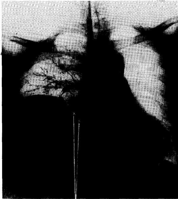
Compressed middle and lower lobe bronchus