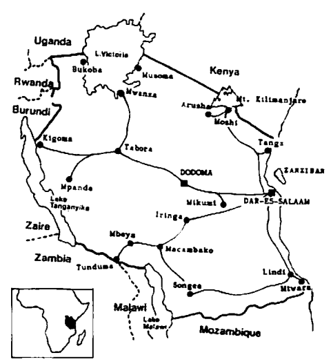
Fig. 1. Dar-es-Salaam in relation to other local administration (Some have been omitted). Refer from leaflet of Coffee Authority of Tanzania, Coffee from Tanzania.

The City Government of Dar-es-Salaam, Tanzania, shoulders the heaviest responsibility of any local authority in the country. The magnitude of its responsibility is so high because of the density of population it has to care for since the City is the largest concentration of people in Tanzania. Dar-es-Salaam's sphere of its immediate influence extends to many of the surrounding villages and towns which focus on it as the market for their produce and the source of supplies and consumer goods. It is a centre of attraction among Tanzanian urban centres and the appetites of many nationals point toward a taste of life in Dar-es-Salaam during their life time. And, with its fine natural harbour, "a heaven of peace" for sea vessels, Dar-es-Salaam has become the major port in East Africa catering for Uganda, Rwanda, Burundi, Zaire, Zambia, Malawi, Mozambique and even far-away Zimbabwe. Tourism in Tanzania commences in Dar-es-Salaam after the tourist steps out of the French modernized International Airport and takes a limousine to the fine up-to-date international standard hotels sprouting around the City or cruises in its fine Indian Ocean waters. The City has also become the major port and centre of commerce and industry in Tanzania. And, certainly you are warmly welcome to Dar-es-Salaam, Tanzania.