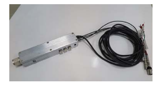
Fig. 1 Amplifier for a neutron detector

Table 1 shows relative neutron counts compared to counts at 0 Gy/h. It was found that the ratio was reduced by 25 % at 2.0 Gy/h and 50 % at 4.0 Gy/h though the ratio at 1.3 Gy/h was almost constant. These results will give us important information to develop a new measurement system in high gamma ray dose environments. In the future, we will examine other neutron detectors for use in such severe environments. It may enable us to achieve further improvements.