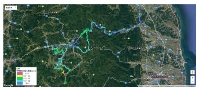
Figure 1. GPS-mapping of environmental radiation distribution on Google around the central litate. Radiation dose of almost all living areas are less than 0.3µSv/hr (3.16, 2017).

At the end of March 2017, after the seventh year of the earthquake disaster, governmental order for evacuation was mostly terminated except for Nagadoro where radiation levels are still high. The radiation level in the living zone of litate village has decreased to less than 0.3 µSv/hr and it is about 1 µSv/hr even when going to worship deep in the mountain of Yamazumi shrine that worships the local mountain gods (Figure 1). The form of life style of villagers is varied, after the evacuation order for them is terminated. Villagers trying to return home in Iitate immediately will be less than 20%. Most of them are elderly people with little risk of radiation damage, and it is difficult to regenerate the community. The only clinic that has restarted at litate manages the outpatient clinic only twice a week in the morning.