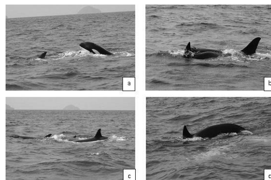
Fig. 3 Possibly Type A transient killer whales sighted on 19 March 2007 at Surin Island, Phang-nga Province (a) the clear large oval patch at the eye, (b) characteristics of the dorsal fins, one more pointed dorsal fin tip and another round, (c) three were seen in a group, and (d) one whale had no distinct dorsal cap and another showed the white ventral side

Jefferson et al (2008) stated that Type A killer whales may show great interest in vessels; at other times they may avoid them. Killer whales often breach spyhop, flipper-slap and fluke-slap; they often perform these behaviors in bouts. In this study killer whales were seen swimming following the boats in Phang-nga Province in 1993 and 2000 (Ranawan Booprakob and Nut Sumontemi, personal communication, Table 1). In 2006 and 2007, killer whales swam close to the tourist boats for an hour (Thanakorn Saengdaw, personal communication;