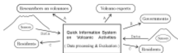
Fig.3 Concept of information system on volcanic activity

Now, this system is in test operation at SVRC. We have several problems to be solved on practical use of this system, e.g. check of result of classification of volcanic earthquakes, criteria for evaluation of eruption potential and some technical problems.