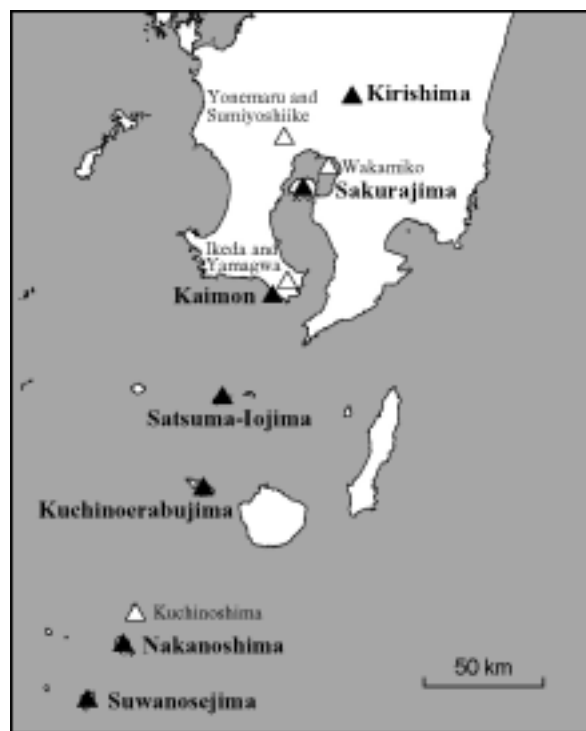
Fig.1 Active volcanoes in southern Kyushu. Open triangles are those added as active volcanoes by revised definition of active volcanoes in 2003.

ash in 1997. Kuchinoerabujima volcano, which repeated strong phreatic explosions, indicated gradual increase in volcanic activity. Thus, southern Kyushu is the best test field to develop monitoring and evaluation methods on volcanic activity. In addition, Kagoshima prefecture government published volcanic hazard maps and made plan for mitigation of volcanic hazards for these volcanoes (Table 1).