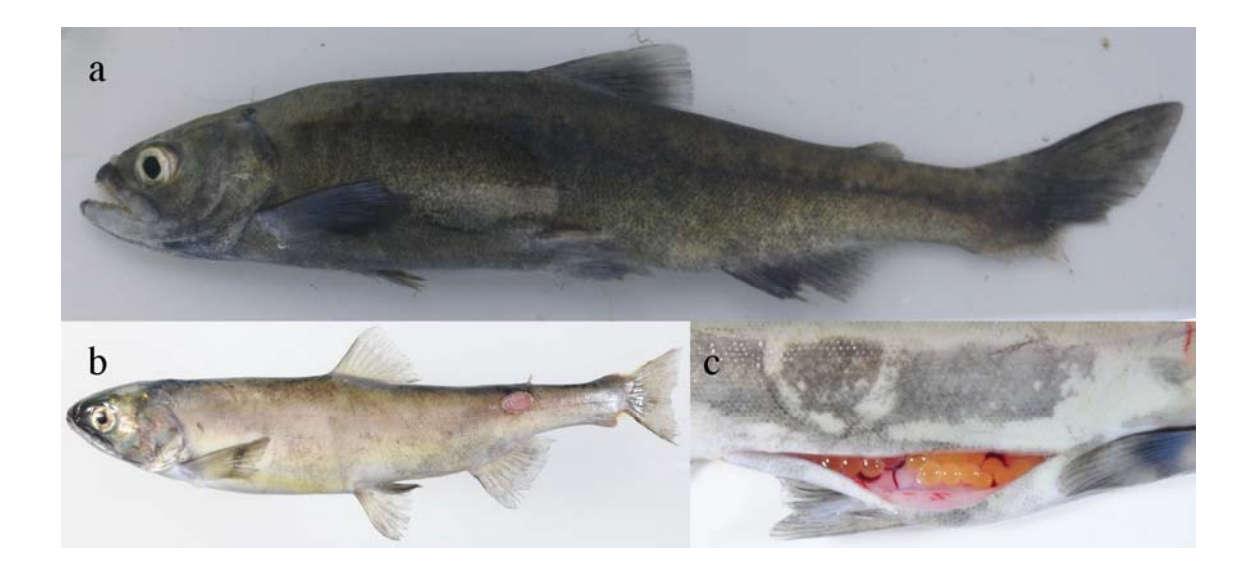
Fig. 1 Oncorhynchus kawamurae from Lake Saiko, Yamanashi Prefecture, Japan. a FAKU 97767, male, 180.5 mm SL, living, just after capture, collected on 4 April 2010 (photo by H. Ito). b FAKU 97743, female, 203.1 mm SL, one day following preservation on ice, collected on 19 March 2010 (photo by T. Nakabo). c FAKU 97742, female with matured eggs one day following preservation on ice, collected on 19 March 2010 (photo by T. Nakabo)