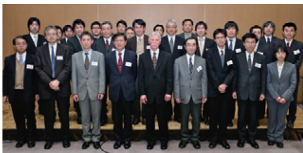
The 1st Symposium on Material Synthesis (3-4 December 2010, at Kyoto University)

Catalysis Research Center, Hokkaido University