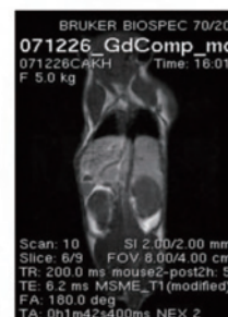
Gadolinium complex of chiral dendrimer (left) used in magnetic resonance imaging of cancer in mouse (right)