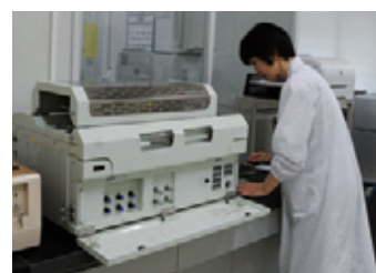
The management office for the common-use instruments