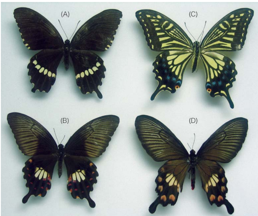
Fig 1. Females of three butterfly species/morphs. (A) Papilio polytes , cyrus form (non-mimetic). (B) Papilio polytes , polytes form (mimetic). (C) Papilio xuthus . (D) Pachliopta aristolochiae .

The angular velocity of a wing stroke was calculated as the total wing stroke angle ( \phi_{\max} - 2 \times \phi_{\min} + \phi_{\max} of the next wing stroke) divided by the duration of a cycle of the wingbeat. Angular velocity was then averaged for one successive flight for a given individual. Mean angular velocity was defined as the mean value of angular velocity for each species/morph. The wing positional angle (mean \phi_{\max} , mean \phi_{\min} ) was estimated visually. The error with this method was determined to be 4.02 \pm 3.6^\circ