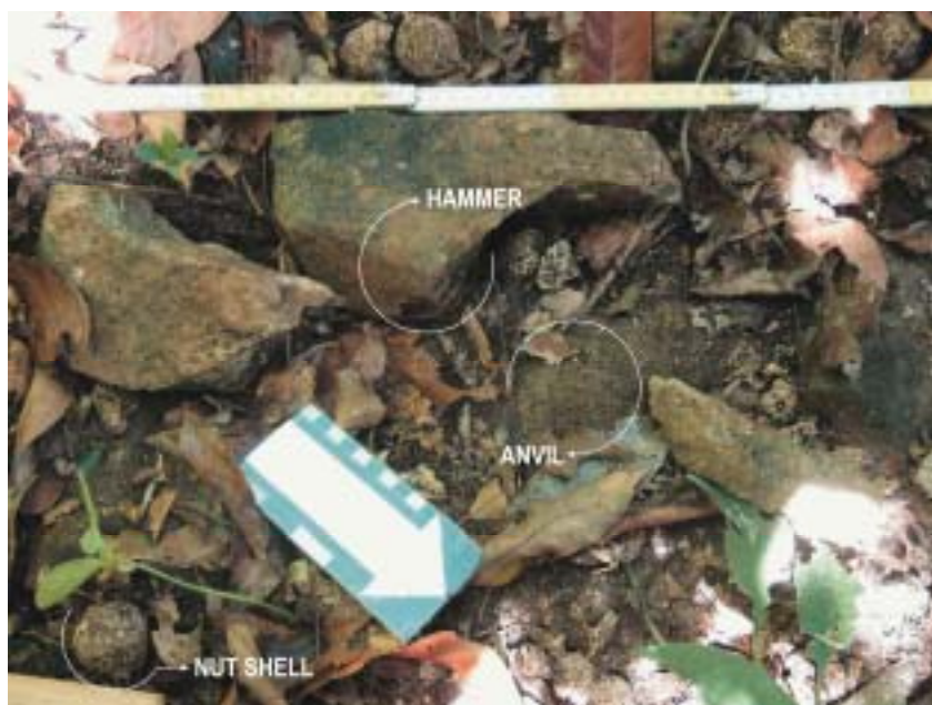
Fig. 2. The SB 6 site in the Kourouhan area (Mont Medou). Large quartz hammers to open crack the Panda nuts were found on the top of the outcropping anvil. Refitting of stones was also detected.