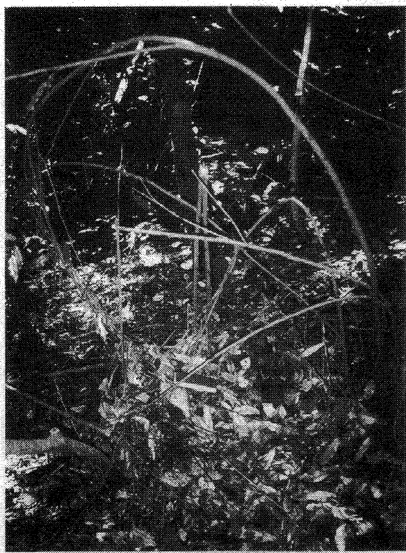
Figure 2. A ground bed made with bent branches.

A possible explanation for the low height of beds and the existence of ground beds in Kalinzu is the low density of large carnivores. Cases of predation on chimpanzees by lions or leopards were reported from several sites (9, 10, Furuichi, this volume), but those carnivores were not observed, and their footprints were only found twice during a census of more than 1,000 km taken in 1997. The average height of beds was the highest (23.2 m) in Tai Forest (8) where the most frequent predation by leopards was reported. Baldwin and others (11) have reported that chimpanzee beds were made at higher positions in savanna-woodland with more carnivores on Mt. Assirik than in the rain forest in Equatorial Guinea. Further studies on the bed height and existence of ground beds are expected to confirm the relationship between the bed-building behavior and risk of predation.