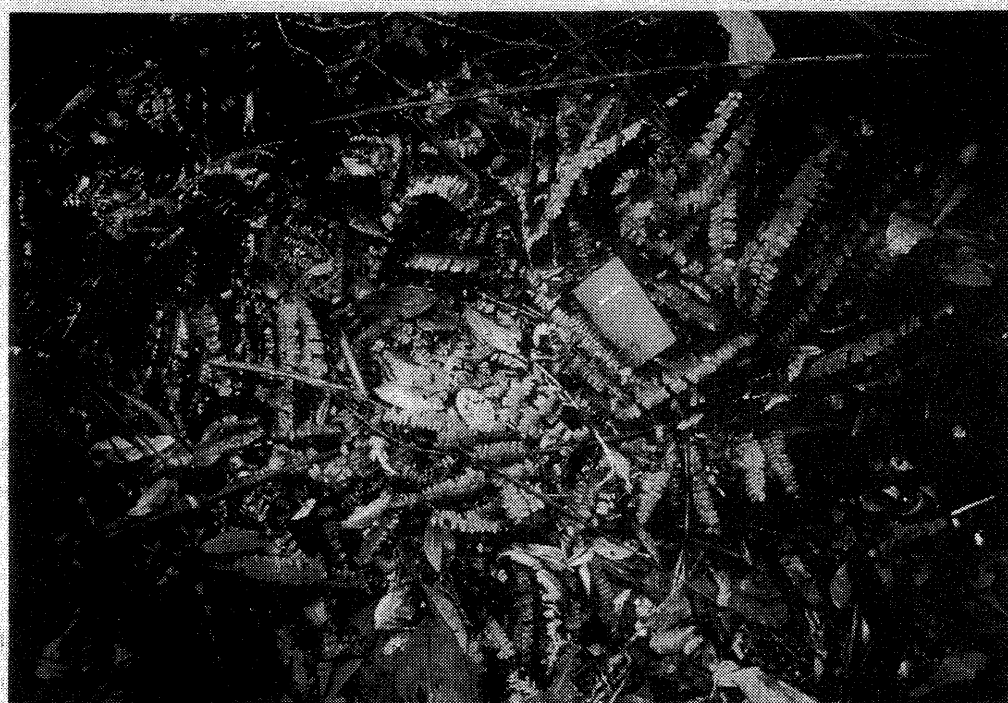
Figure 3. A cushion used for resting in daytime.