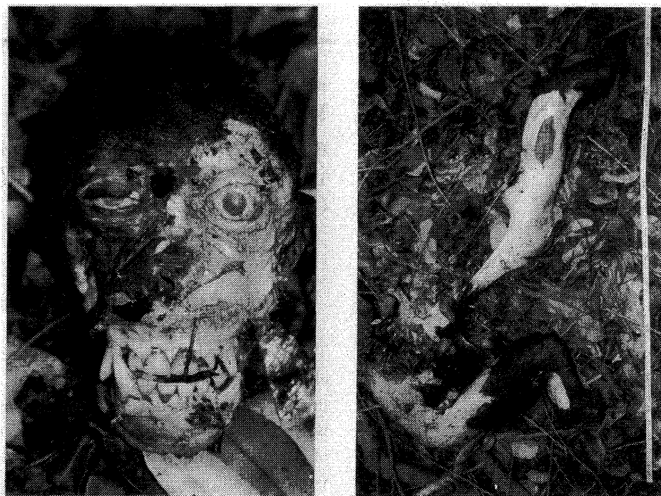
Figure 1. Head (left) and lower half of the body (right) of the carcass.

Leopard dung was found at the side of the chimpanzee shoulders, and there were new footprints of an adult leopard in a savanna grassland about 20 m from the carcass. These remains suggest that an adult leopard ate a late adolescent male chimpanzee, which was probably killed by the leopard because leopards do not usually eat dead animals. Although I do not know whether this chimpanzee was in good health, this observation suggests the possibility that predation by leopards is a threat for chimpanzees in this area.