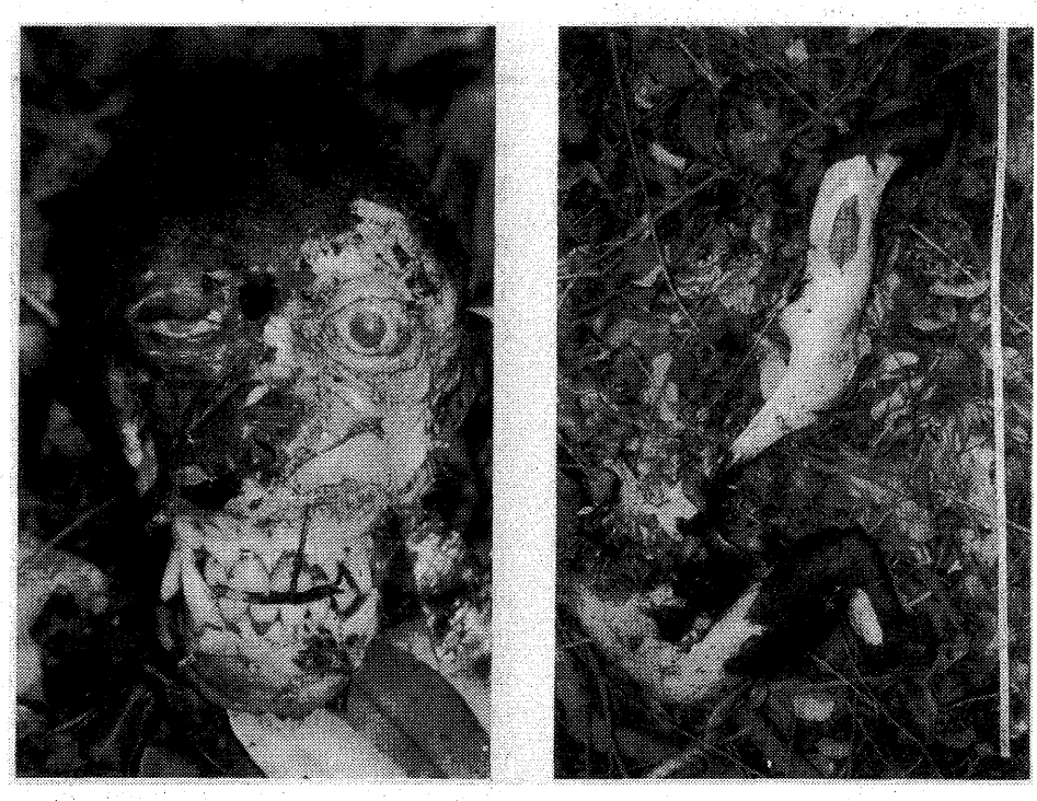
Figure 1. Head (left) and lower half of the body (right) of the carcass.

Leopard dung was found at the side of the chimpanzee shoulders, and there were new footprints of an adult leopard in a savanna grassland about 20 m from the carcass. These remains suggest that an adult leopard ate a late adolescent male chimpanzee, which was probably killed by the leopard because leopards do not usually eat dead animals. Although I do not know whether this chimpanzee was in good health, this suggests the observation possibility that predation by leopards is a threat for chimpanzees in this area.