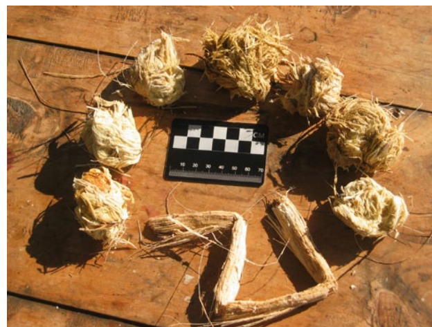
Figure 4. Jumbled (standard) and folded pith wadges of Cyperus papyrus at Kanyawara, Kibale National Park.

But what about the odd-even difference? Perhaps chimpanzees consistently clipped lengths of pith that when folded to the optimal segment-length of about 3–4 cm were somehow biased toward an odd number of folds. This seems nonsensical. If an ape were sufficiently picky about producing exactly the right number of folds to fill up the mouth, then on average, all other things being equal, one would expect a 50:50 chance of odd or even, given individual variation in buccal volume.