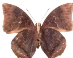
5. (ventral view)