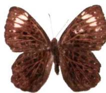
6. (dorsal view)