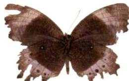
3. (ventral view)