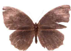
1. (dorsal view)