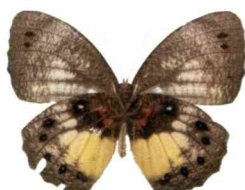
4. (ventral view)