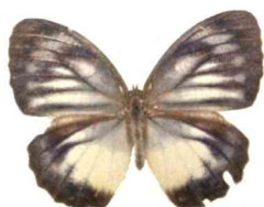
4. (dorsal view)