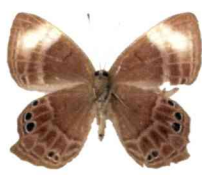
7. (ventral view)