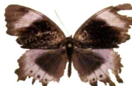
3. (dorsal view)