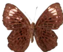
6. (ventral view)