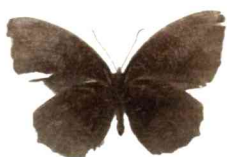
1. (ventral view)