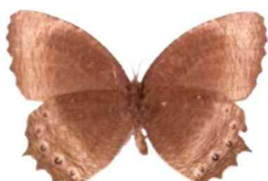
2. (ventral view)