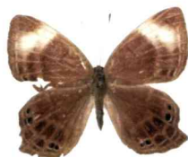
7. (dorsal view)