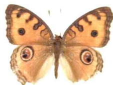
7a. (dorsal view)