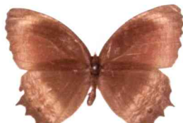
2. (dorsal view)