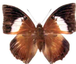
5. (dorsal view)