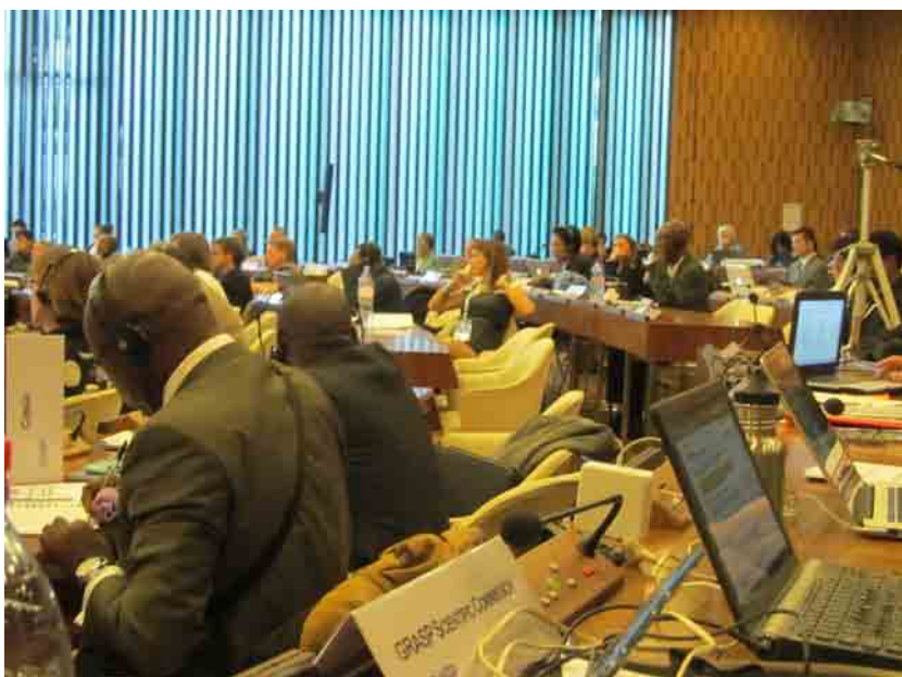
Figure 1. The 2nd GRASP Council was held 6–8 November 2012 at UNESCO headquarters in Paris.

150 people gathered for this 3-day meeting.