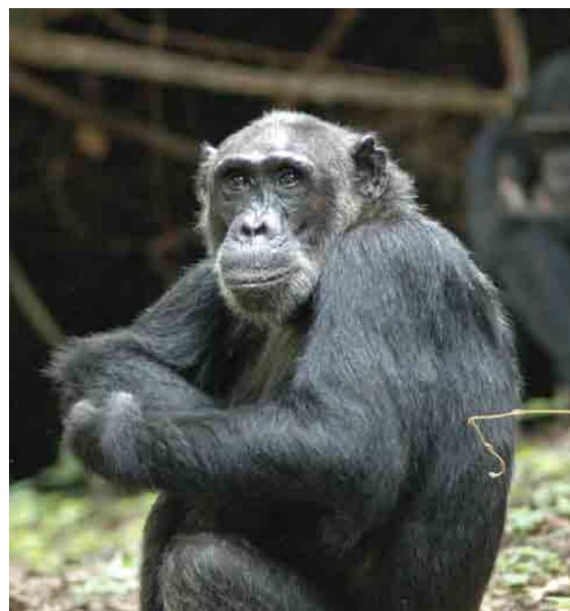
Figure 1. Calliope in 2010 (at estimated age of 50 years old). Although her hair was white, she did not look old.

According to Nishida 1 , Calliope had been very shy to human observers until the 1990s. Although she later became tolerant of observations from a certain distance, she continued to be more timid than the other females. She seemed reluctant to get too close to humans, especially when she had a small baby. Throughout her life, Calliope gave birth to a minimum of 5 offspring ( i.e. , 3 females and 2 males) 2 . Except for 1 female offspring who died at 3 years old, the other 4 were weaned and reached the age of puberty. Thus, it can be said that she was a successful mother. After she gave birth to her last offspring in 1997, she did not give birth again throughout the last 15 years of her life. Excluding the 5 years during which she was nursing her last baby, she enjoyed her remaining post-reproductive life for 10 years.