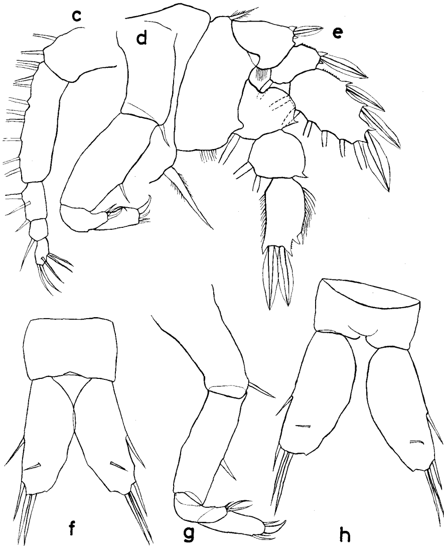
Fig. 2. Sapphirina salpae CLAUS

Female; c, 1st antenna; d, 2nd antenna; e, 4th leg; f, anal segment and furca, dorsal aspect. Male; g, 2nd antenna; h, anal segment and furca, dorsal aspect.