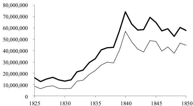
Fig. 1 Commodity Exports from Java and Madura, 1825–50 (Total Trade [bold line] and Trade with the Netherlands [fine line]) (Fl.)

The commodity import trade is shown in Fig. 2. The most remarkable point in this figure is that the import values were somewhat smaller than figures for the export trade. Exports grew rapidly during the 1830s, while import growth was not so significant. During this period, the major import from the Netherlands was cotton textiles. On annual average, 828,169 guilders' worth of cotton textiles was imported to Java from the Netherlands in 1825–28 and 5,049,857 guilders' worth in 1848–50 (Bruijn Kops 1858, Vol. 1, 42). Yet, the Dutch industry in this sector was not very well developed. Thus, a huge amount of bullion had to be sent to Java from the Netherlands to pay for colonial crops. Indeed, large amounts of high-quality British cotton textiles were imported into Java, especially