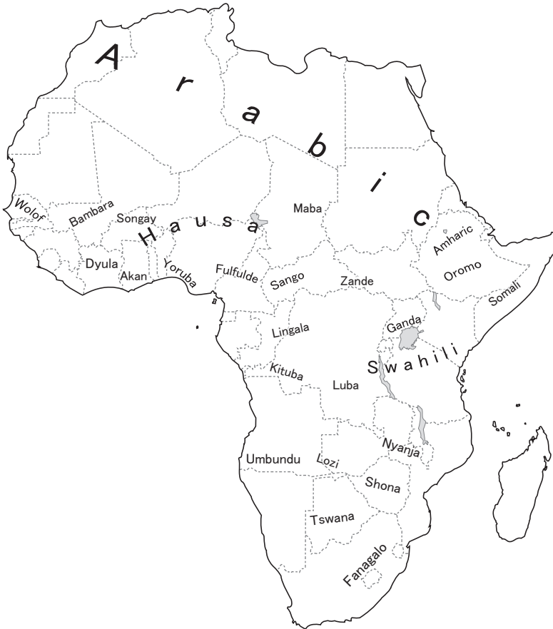
Fig. 2. Main lingua francas in Africa (Heine and Derek, eds., 2000: 325)

limited area, such as Zande in the northeastern region of the DRC (and beyond the border toward Central Africa). Some ethnic languages may have become regional lingua francas that are used commonly by different language groups, such as Akan in the southern and central part of Ghana. These are varieties of lingua francas, and not addressed further in this paper.