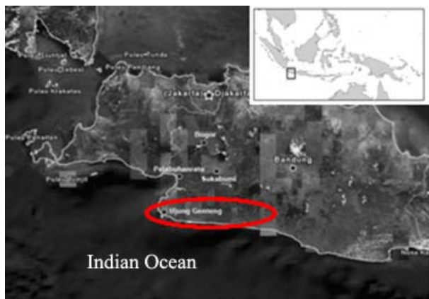
Figure 1. Pangumbahan Beach, West Java, Indonesia.