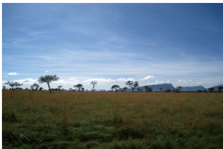
Fig. 3. Open grassland at Nakicumet Napak District