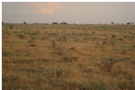
Fig. 4. Shrubs mixed with grasses in Lomejan Village in Kotido District

lands, ten plots of 5 \times 5 \text{ m}^2 in the thicket and shrublands, and twenty plots of 1 \times 1 \text{ m}^2 in the grasslands. Onsite identification of available grass and browse species was conducted in each of the plots. Grass and browse species that could not be readily identified were safely stored in a plant press and taken to Makerere University herbarium for further identification.