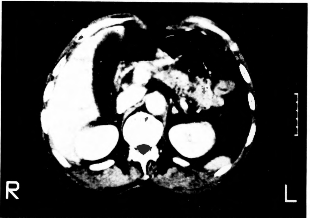
Fig. 1. Abdominal CT scan shows an enlarged gallbladder with no evidence of a gallstone.

Carcinoma of the cystic duct is extremely rare. According to FARRAR 2) , the following criteria must be satisfied for the diagnosis of primary carcinoma of the cystic duct: (1) the growth must be restricted to the cystic duct; (2) there must be no neoplastic process in the gallbladder, hepatic, or common bile ducts; (3) a histological examination of the growth must confirm the presence of carcinoma cells. In 1978, MANABE and SUGIE 3) reviewed only 21 cases in the literature that met FARRAR's criteria, including their own case. Herein, we present an addi-