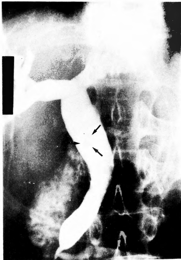
Fig. 2. Endoscopic retrograde cholangiopancreatography demonstrates a faint filling defect, presumably at the entry site of the cystic duct (arrow). The cystic duct and gallbladder are not opacified. Dilatation of the common bile duct and main pancreatic duct is also noted.

Physical examination revealed a smooth, nontender mass of 7×5 cm in the right upper quadrant of the abdomen. Hematological and biochemical findings were within normal limits, except for a slight elevation of total bilirubin 1.44 mg/dl (normal range 0.10–1.00). An upper gastrointestinal X-ray series showed no abnormalities. Drip infusion cholangiography (DIC) disclosed nonvisualization of the gallbladder. Computed tomography (CT) and ultrasonography showed an enlarged gallbladder, with no evidence of a gallstone (Fig. 1). However, endoscopic