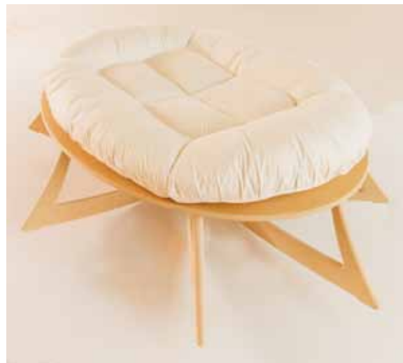
Figure 3. The Human Evolution Bed (the 4th prototype).