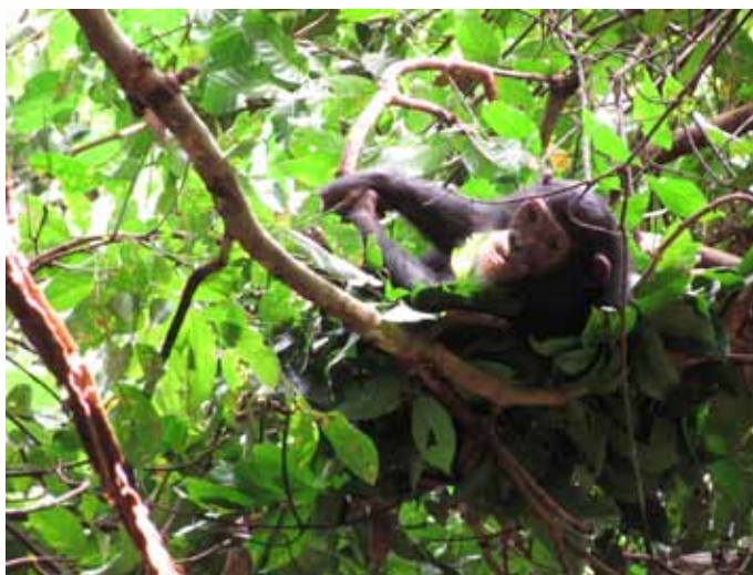
Figure 2. A chimpanzee day bed. Fimbi, a juvenile female chimpanzee in Mahale, lying in the bed on December 21, 2010.