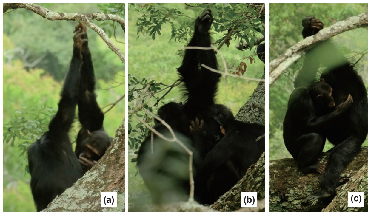
Figure 2. Issa chimpanzees engaged in three types of grooming hand clasp. (a) wrist to palm, (b) palm to palm, and (c) wrist to wrist

with a sexual swelling), and one infant.