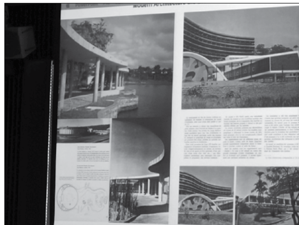
Fig.3 Modern architecture Brazilian influence