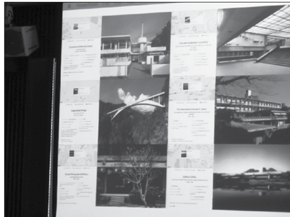
Fig.2 Virtual Exhibition sample contents' page from the DOCOMOMO website

We made a kind of excel and database with all of our 600 places identified there (Fig.4). We re-draw the ones we were able to: open air cinemas, it is an incredible recent huge project that the institute made in Angola with a very beautiful book just about open air cinemas. Amazing this kind of typology: schools also just to give an idea. And I finished. Very very quickly.