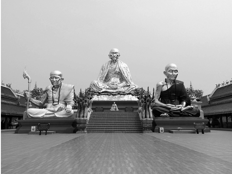
Appendix Photo 4 Statues of the Three Greatest Khruba of Lan Na: Siwichai, Khao Pi, and Wong at Wat Saengkaeo Phothiyan, Mae Suai, Chiang Rai, Thailand