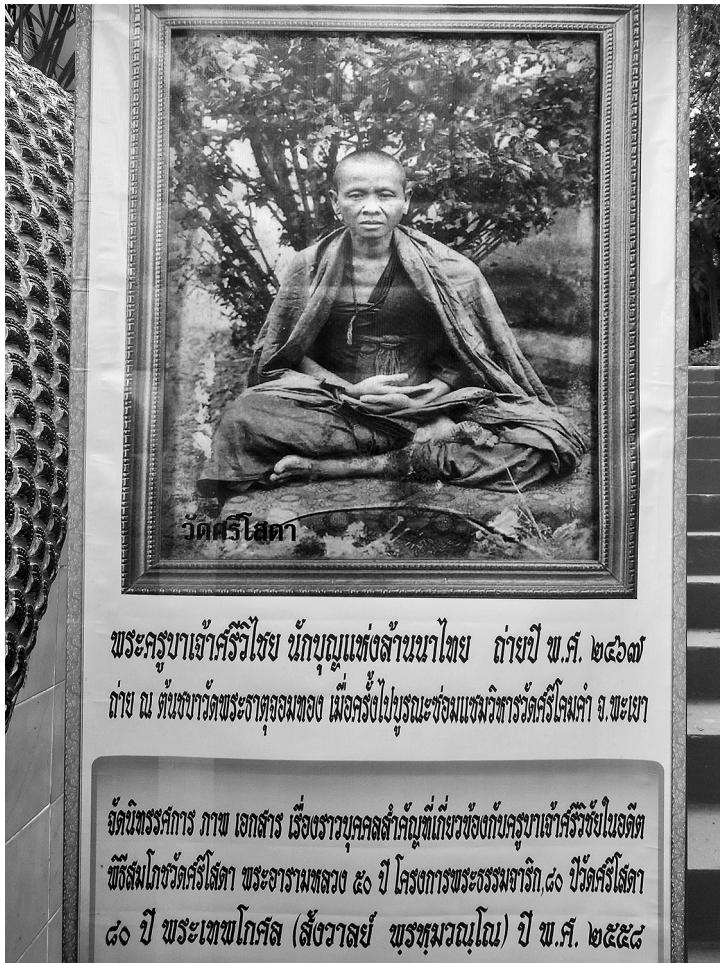
Appendix Photo 1 Khruba Siwichai, an Exhibition of Wat Si Soda 2015, Mueang, Chiang Mai, Thailand