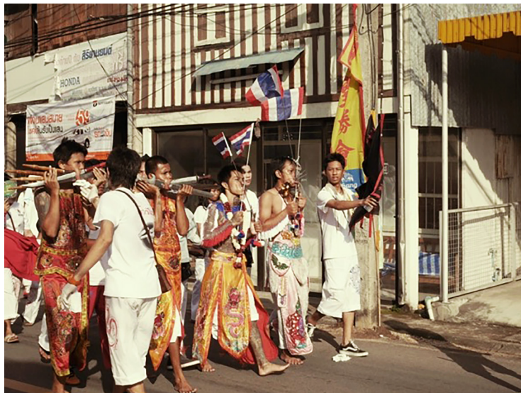
Fig. 3 A Companion (Left) Wipes Blood off a Mah-song 's Wound, while Another Companion (Right) Raises a Black Flag ( Orleng ) to Protect a Mah-song from the Sun (October 4, 2014).

walk along the street from a shrine to a coastal area called Sapan-Hin to commemorate the event in which an incense urn, a symbol of the Nine Emperor Gods, was brought from China to Phuket. Along the path of the procession, devotees set up street altars and wait to worship the Chinese deities who have possessed the bodies of mah-songs .