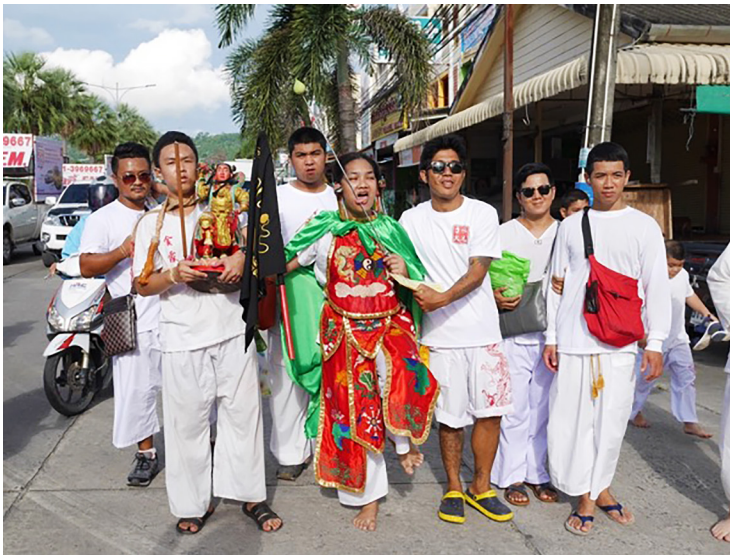
Fig. 2 A Mah-song (in the Red Apron with Long Needles Piercing His Tongue), a Huatkua (Standing behind the Mah-song ), and Devotees at the Street Procession of Naka Shrine (October 14, 2015)

In these ceremonies, the main participants are the spirit mediums (Thai: mah-songs ), ritual specialists (Hokkien: huatkuas ), and devotees (see Fig. 2). Huatkuas conduct the ceremonies and invite the Chinese deities to possess the bodies of mah-songs . Mah-songs , while in a trance, speak in tongues in Hokkien-Chinese dialect and join the huatkuas in conducting the ceremonies by reciting prayers and blessing the devotees. A devotee who is faithful to a particular mah-song can choose to become a companion providing financial support and voluntary labor during an important ceremony. Mah-songs also play the main role in the street procession, a well-known component of the Vegetarian Festival (see Fig. 3). In this procession a myriad of mah-songs , companions, and huatkuas