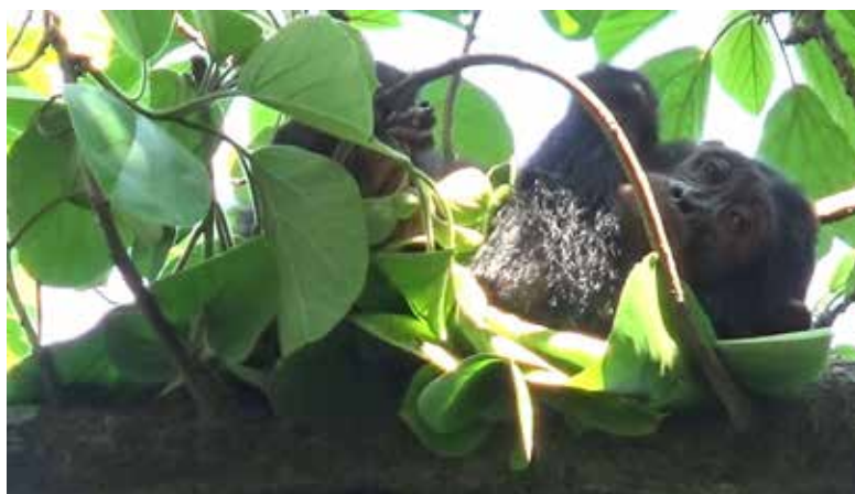
Figure 3. Quinoko resting on a high tree

This means juveniles are still dependent because they lack sufficient knowledge for foraging. However, as we observed in Case 2, Quinoko ate fruits several times and did not seem to have difficulty in finding and eating fruits. At this time, Saba and Pycnanthus , both Mahale chimpanzees' major foods, were beginning to fruit in many places. Thus in such a season, the demerit of being alone on foraging may not be so obvious.