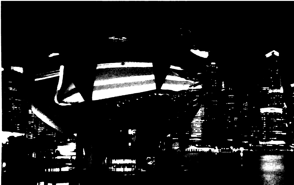
Fig. 2 Projection mapping of “Sound of Ikebana” at ArtScience Museum in Singapore

In February 2013 we carried out a projection mapping of “Sound of Ikebana” at a museum called ArtScience Museum, in Marina Bay area in Singapore. As Singapore does not have clear distinction among four seasons, we thought that showing Sound of Ikebana to Singapore people would be a good chance to let them know four seasons in Japan and at the same time to appeal them Japanese culture represented by Ikebana. The projection mapping event gathered more than ten thousand people and were well welcomed by them [5]. Figure 2 shows a scene of the projection mapping of Sound of Ikebana at the Art Science Museum.