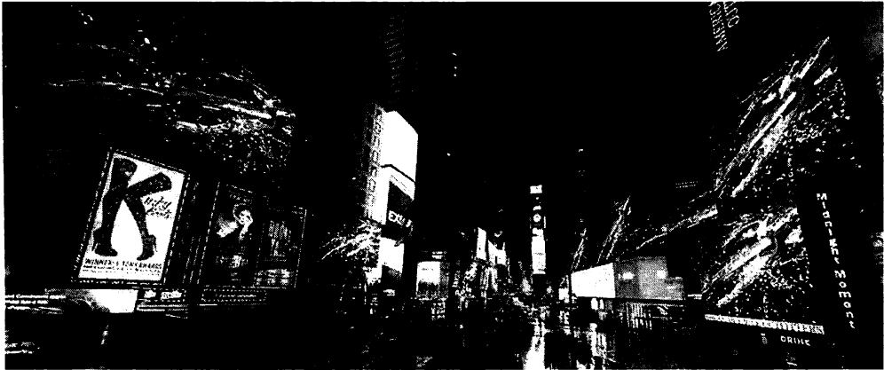
Fig. 5 Exhibit of “Sound of Ikebana” at Times Square in New York

out. As the application for the exhibit is open, we submitted our application to Times Square Alliance and our application was fortunately accepted by them. Based on this we carried out the exhibition of “Sound of Ikebana” in April 2017. Figure 5 shows a scene of the exhibit.