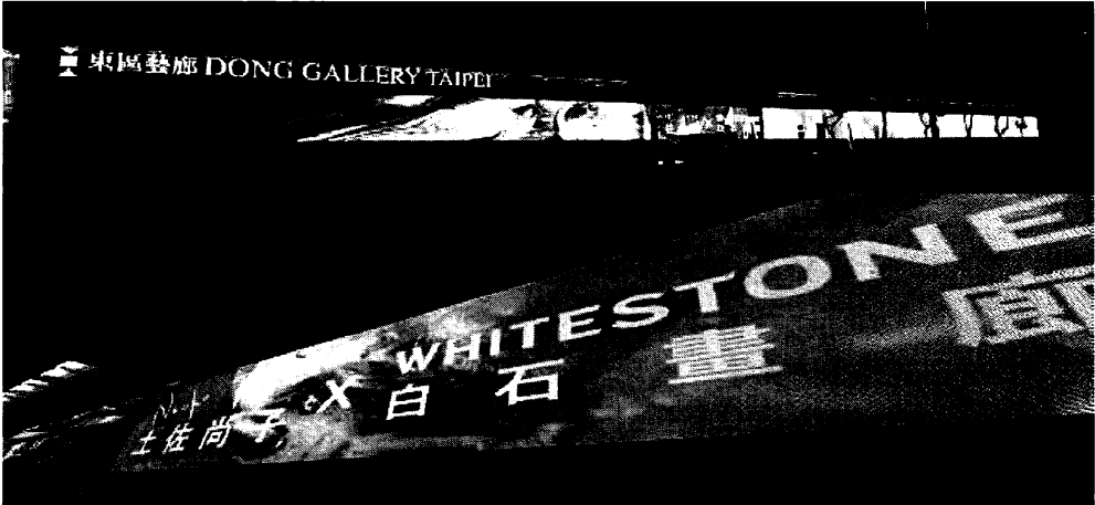
Fig. 6 Exhibit of “Sound of Ikebana” at Dong Gallery in Taipei, Taiwan