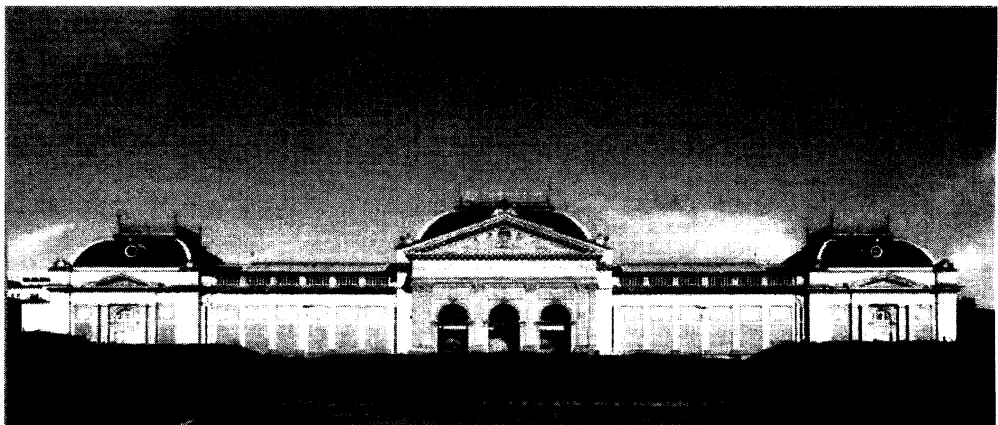
(a) Outlook of Kyoto National Museum