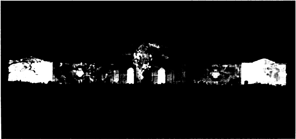
(b) A scene of projection mapping