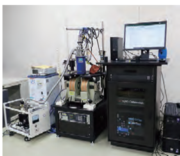
Hall Effect Measurement System