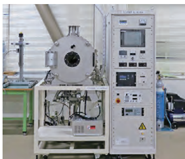
Sputter Deposition System