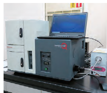
Absolute PL Quantum Yield Measurement System