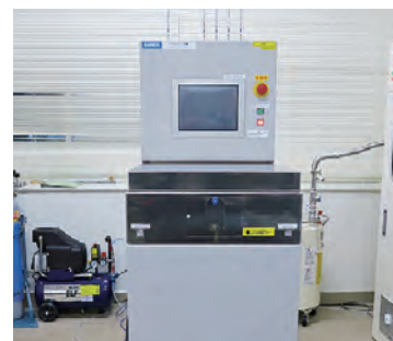
Dry Etching System