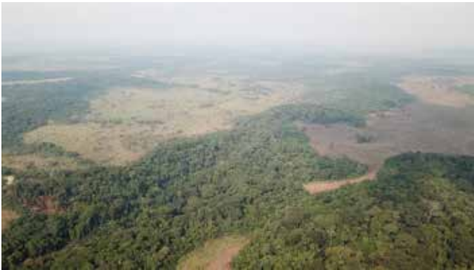
Figure 2. Aerial photo of Nkala forest taken by a drone.