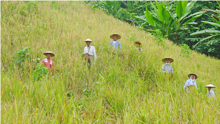
Fig. 3 Work Group Harvesting at Long Peluan

This inclusive concept of identity, lun tauh , denotes an outlook that has been passed down from a time when Kelabit, Ngurek, and Sa’ban were small groups forming alliances against common enemies on a river system, when they intermarried and shared resources, culture, and languages. They formed work parties, hunting groups, and trading groups utilizing resources within their territory (Fig. 3). Such openness was necessary because they needed to keep their population at a viable level for shifting cultivation, warfare, and trading journeys. Longhouses survived over time through these open relationships.