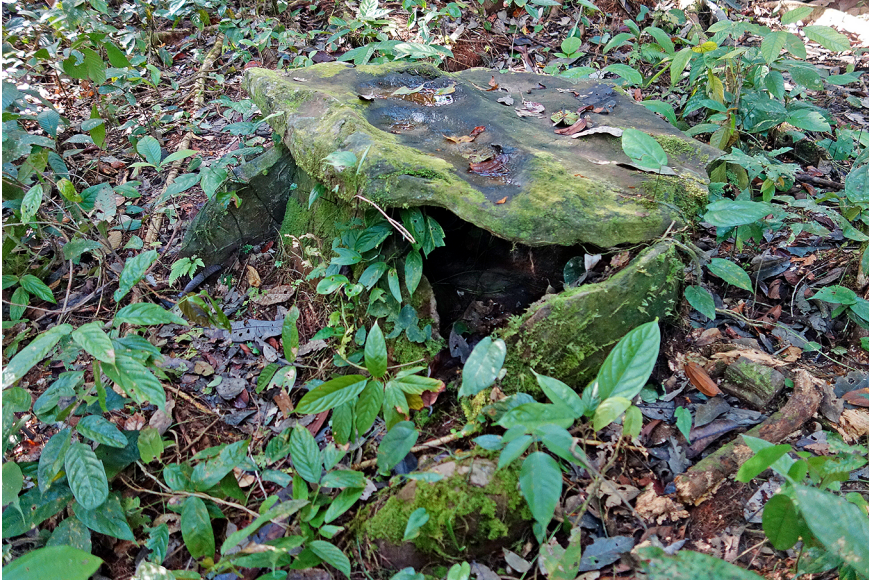
Fig. 4 Stone Graves at Long Peluan

urgent as elders are unable to take younger members of the community out to show them the significant features of their land because of changes in the landscape, or because the younger members of the community are away earning money offshore or in coastal cities.