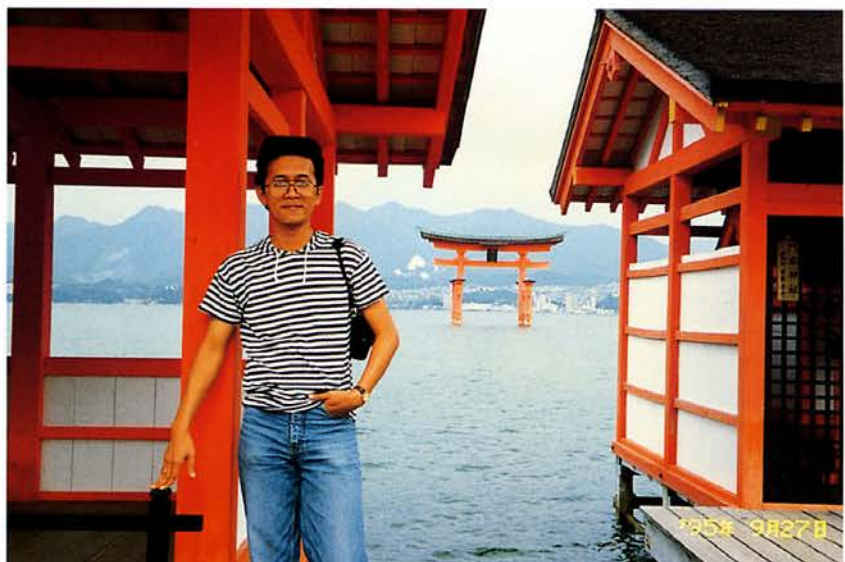
University Excursion to Miyajima

My wife and two sons came to Japan in November 1993, when my second son was only four months old. While we lived in Japan for more than five years, we got to know many aspects of Japanese culture. However at the beginning of our life in Japan, we were not able to socialize with the surrounding community for several months because of the language barrier or the difference of our customs. Then I decided to send my children to Hoikuen. Now they have many friends and speak Japanese like native children. Sometimes I even ask them to explain some amusing conversations in TV programs. They know almost a half of the 151 names of Pocket Monsters. They know all Japanese children's heroes, such as "Urutoraman". They like to eat at kaiten sushi bar. They really feel great in Japan. My life in Japan has been rich with not only academic experiences but also rich in a variety of cultural learning.