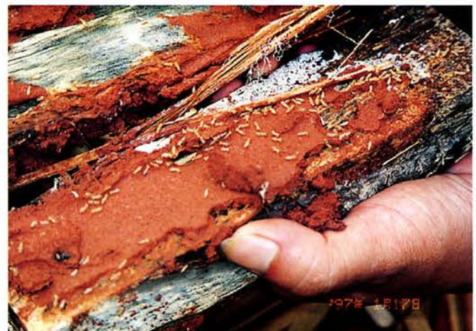
Fungus-growing termites attacking timbers in a field test site at Serpong