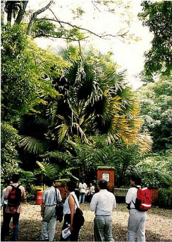
Bogor Botanical Garden

ity was recovered for the present, however we could see everywhere the influences of economic failure and the scars of disturbance.