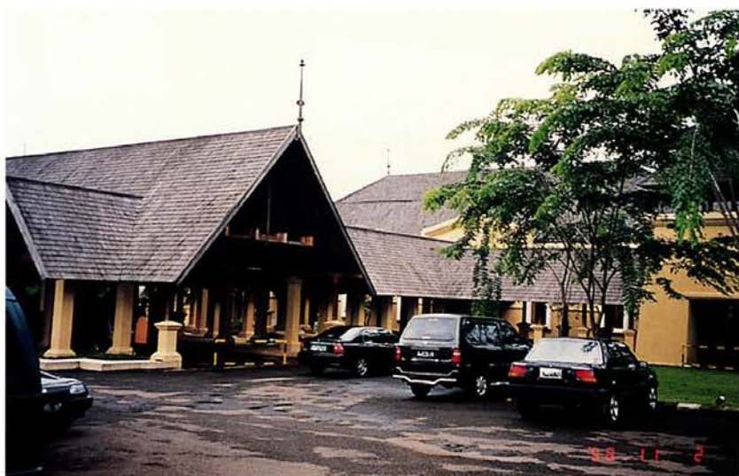
Symposium Venue: Novotel Hotel

Before all participants went back home, we took photograph together in the front of the seminar hall for a memory. "Matta aimasho", hopefully we will see you again in The Third Wood Science Seminar that will be held in Kyoto, Japan in the year 2000.