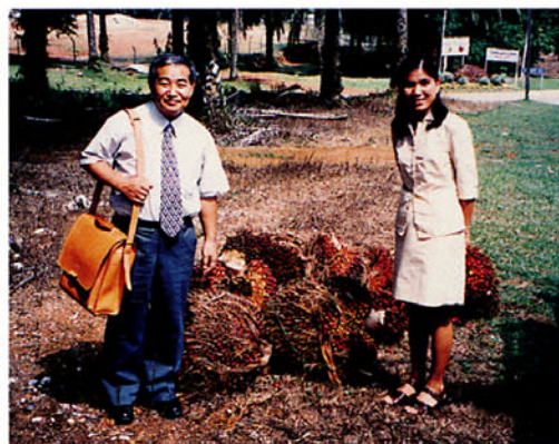
A snapshot near UPM campus.