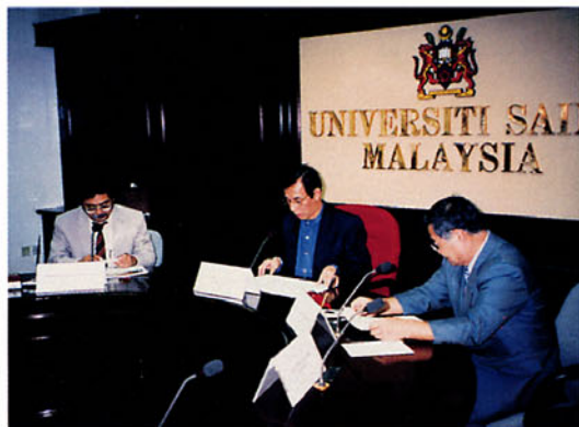
The signing ceremony of MOU.