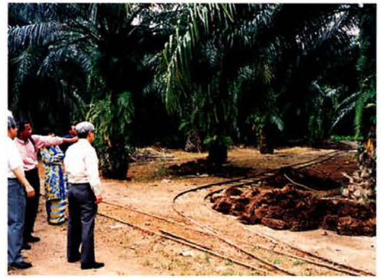
Observation in the natural degradation process of empty fruit bunches at the oil palm plantation site. mill; Golden Hope Bhd., Malaysia

Cement bonded board from oil palm was successfully manufactured using accelerators for setting or carbon dioxide curing system. A new mechanical orientor was developed for manufacturing oriented medium density fiberboard (MDF) and oil palm fibers were applied. The results show that the product provides high performance in both mechanical and dimensional properties.