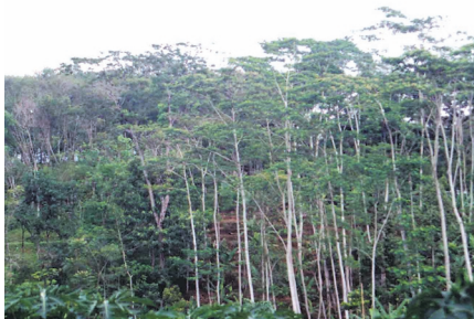
Paraserianthes falcataria (L.) Nielson ('sengon') tree

research: Acacia mangium Willd, Paraserianthes falcataria (L.) Nielson and Palaquium hexandrum Burk, all of them are indigenous plants of Indonesia native to Moluccas and known as commercial timbers. The selection of these species was also related to the forestry program in Indonesia. Since PELITA IV (Fourth Five-Year Development Plan: 1983-1988), one of the program of the Indonesian Government in the forestry sector has been Industrial Forest Estates (HTI). Twenty-eight species have been recommended for use in this program, including the three species in this program, of which Acacia mangium Willd and Paraserianthes falcataria (L.) Nielson have the highest priority for development. One of the objectives of the program is to fulfill the timber needs for wood industries in Indonesia and abroad. Acacia mangium , locally known as mangium, and Paraserianthes falcataria (L.), locally known as sengon, are both belong to Fabaceae family of fast growing and multipurpose trees species