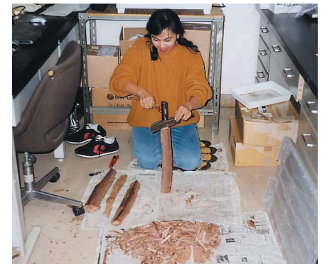
Cutting a wood block to find Cryptotermes domesticus Haviland

Another interesting experience was that, I had a chance to take a Japanese language course. This was important