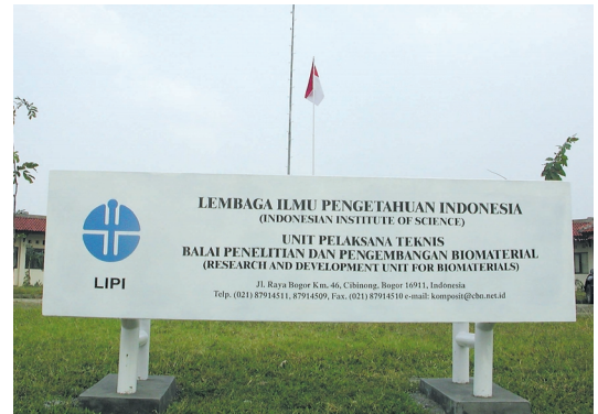
Signboard of the new institute