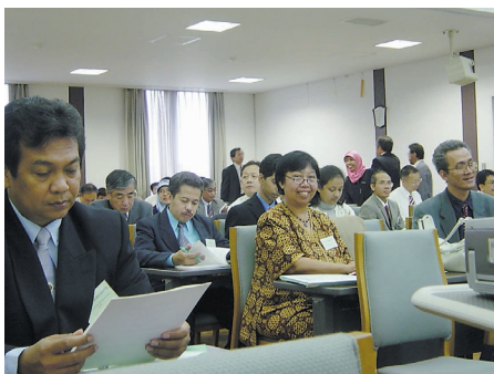
Between the sessions