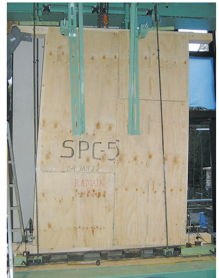
In-plane shear test of LVB panels

In January 2003, the first research project was conducted to evaluate the performance of Indonesian LVL, which were supplied by PT.PSUT in Jambi. Basic