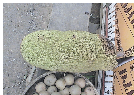
Artocarpus heterophyllus (Jackfruit)

Life forms in tropical forests, particularly plants, produce many chemically strange compounds as extracts, indicating significant biological activities. Most of these are so-called phytoalexins, which are exuded from plants and strongly affect to the survival of surrounding life forms such as insects, fungi, plants and finally, mankind, too. Plant extractives exhibit dual properties in relation to human needs. They have been widely used for medicinal purposes, and at the same time, it has been shown that through prolonged contact, extractives from certain industrial and fancy woods bring about allergic effects in humans (Hausen 1981). Chemical characterization and development of the utilization of those compounds are our main purposes in this project. We may find some novel drugs, just as Aspirin was conducted from willow bark extracts. Furthermore, these plants and their extracts may be effective for bio-remediation or bio-restoration of deteriorated environments.