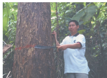
Field survey of the plantation stand of Dryobalanops lanceolata (Sabah, Malaysia)