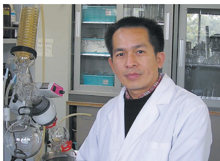
The author at work in the Laboratory of Biomass Conversion, WRI