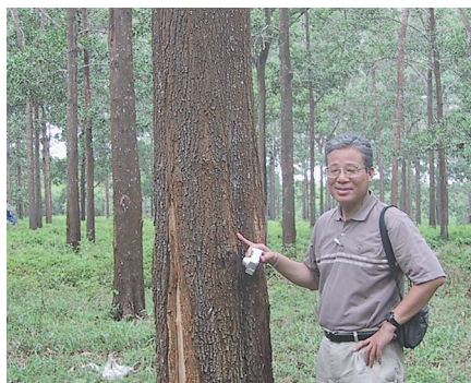
12-year-old Acacia mangium with a diameter of 48 cm in breast height

In September of FY2003, I had the privilege of traveling to a huge Acacia mangium plantation in the southeastern part of Sumatra, Indonesia, operated by PT. Musi Hutan Persada. There I saw an excellent example of a well, designed and managed Acacia mangium plantation of 200,000 hectares. Because of its size, it took four hours to travel from the entrance to a guest house located in the middle of the plantation. On the way to the guest house, piles of acacia logs were seen on both sides of the road waiting for transport to a pulp factory. We met trucks, one after another, carrying logs. In the pulp factory, which we visited next day, Acacia mangium logs were continuously fed from huge stock yards into a massive digester which processes 2.4 million tons per annum. The immense scale of the operation