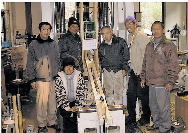
LVL truss loading test and members of the collaborative research team