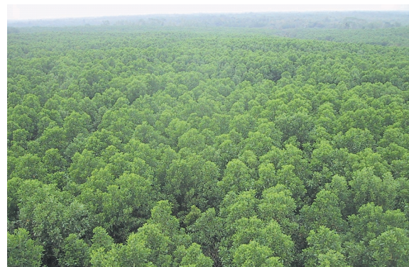
Acacia Plantation in Sumatra (PT. Musi Hutan Persada)

The symposium covering wood formation, biotechnology, pulping, bark utilization, wood-based materials and biological deterioration of wood was extremely beneficial for me by extending my knowledge of Acacia mangium , its properties and utilization. Furthermore, the symposium gave me an opportunity to converse with many scientists having different viewpoints and expertise in Acacia mangium plantation operation. Topics such as diversity of species, risks of monoculture for huge-scale plantations, and social relationships with the local people on the plantation were amongst those discussed. As a direct result of the very successful symposium, Prof. Kawai (WRI, Kyoto University) and I recognized the importance of a broad and inclusive approach