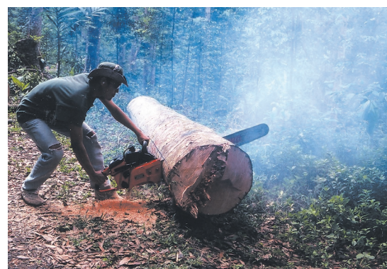
Felling of Agathis and collection of wood disks at Gunung Walat (West Java, Indonesia)

The recovery ratio in sawmills and wood industries, however, is not always high because it sometimes includes compression wood. For the promotion of plantation for timber production of Agathis , it is important to study the relationship between tree growth conditions and the formation of compression wood. This is the main purpose of the collaborative research in Indonesia.