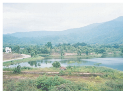
Chiang Mai is surrounded by mountains and forests