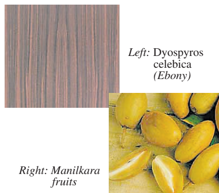
Left: Dyospyros celebica (Ebony)