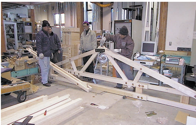
Assembly of LVL truss members