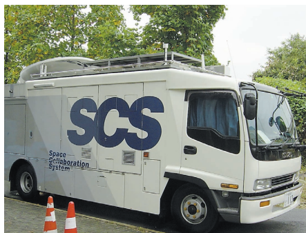
Satellite spots were connected by SCS