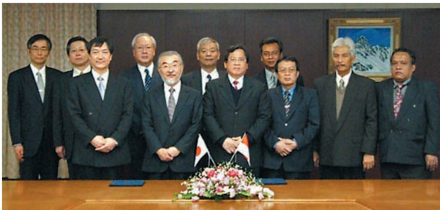
Attendees of the signing ceremony

Thank you very much and terima kasih banyak.