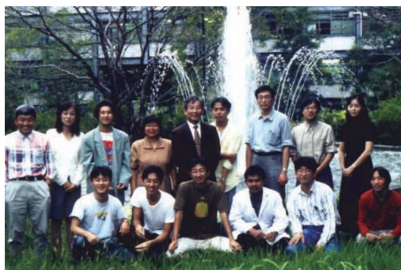
From my old album: I think I was most happy to be surrounded by my collaborators domestic and foreign, and Japanese and Indonesian students. 1998