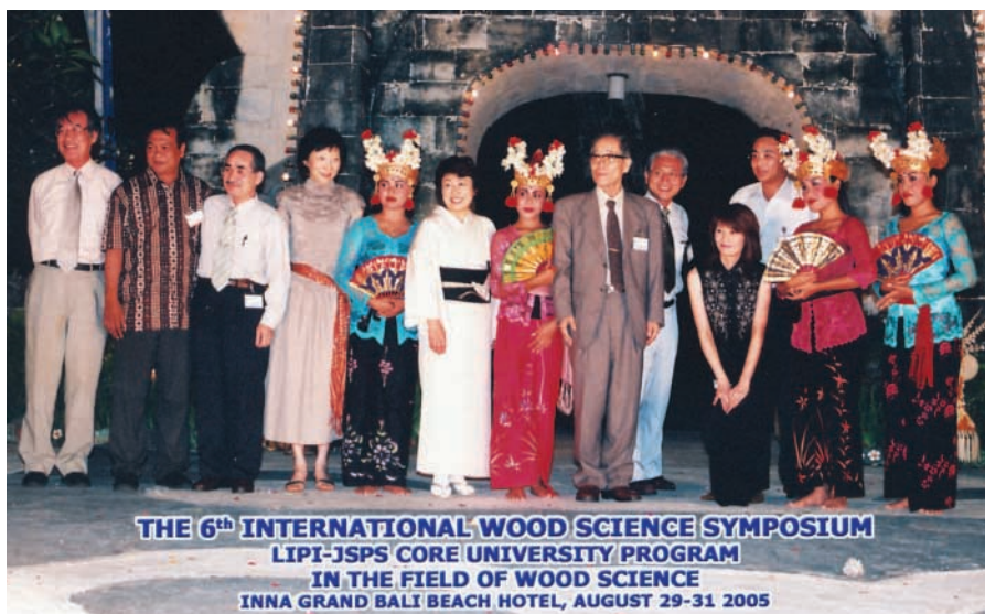
The 6 th International Wood Science Symposium held at Inna Grand Bali Beach Hotel, August 29-31 2005