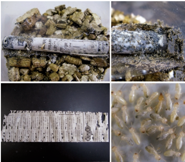
Coptotermes formosanus upper and lower left: attack on newspaper upper right: fecal droppings black from print ink lower right: black print ink accumulating in termite abdomen