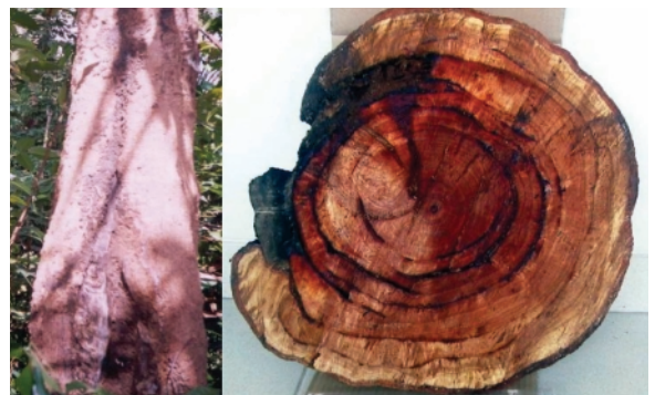
A longitudinal canker and transverse view of the canker disk of a rubber tree found in East Kalimantan, Indonesia

While I was studying, I joined the Japan Wood Research Society (JWRS)