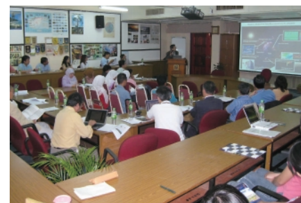
View of the seminar

The program of the seminar is as follows: