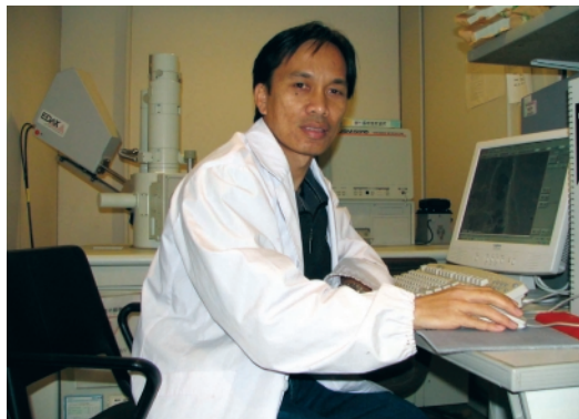
Processing SEM images using EDAX software

In the beginning of April 2004, I came to Japan when the Sakura flowers were in bloom. It was the first time I experienced people gathering under of the full bloom of the Sakura blossoms, enjoying the beautiful red, pink and white flowers while picnicking with food and refreshments in a common tradition called "Hanami". On the second day of my stay in Kyoto, I was really surprised and lucky enough to experience my first Hanami party with the students, researchers and staff