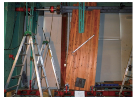
The experimental setup at RISH

Further to this project, my work while I was at Kyoto University has