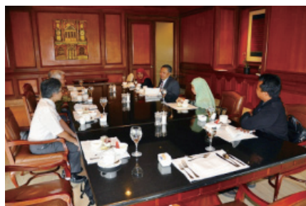
The state of the exchange after the signing ceremony