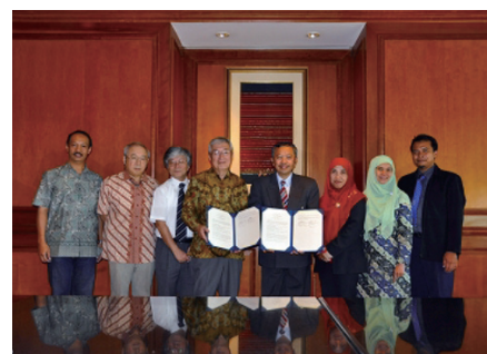
Photo taken by all participants signing ceremony

With the signing of this MOU, a new comprehensive and efficient partnership will be built between the two institutes. RISH hopes to actively promote academic exchange and enhance educational services through joint research, joint hosting of symposia, and an exchange of faculty members.