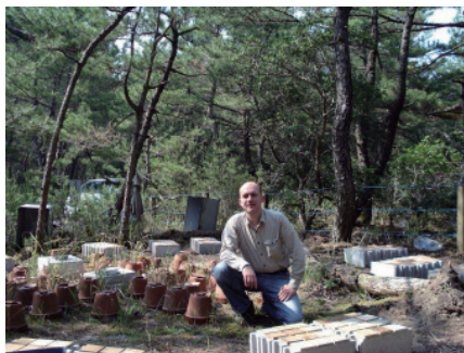
Inspection in the Living Sphere Simulation Field (LSF) near Hioki City, Kagoshima, Japan.