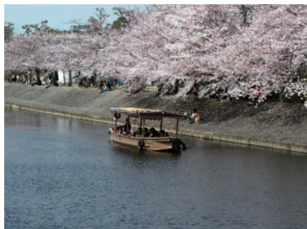
Sakura time in Uji River

My research activities in recent visit included obtaining field test data from post-treated wood-based and in-process treated wood-plastic composites installed in the RISH's Living Sphere Simulation Field (LSF) located near Hioki City in Kagoshima Prefecture on the south west of Kyushu Island, Japan. I was able to visually observe and rate termite and decay damage on the composites exposed to termite and decay activity under protected above ground conditions for 36 months. In general, termite attack is always severer than decay regardless of composite type and retention level based on the field test findings. While SWP, HWP and OSB material treated at higher retention lev-