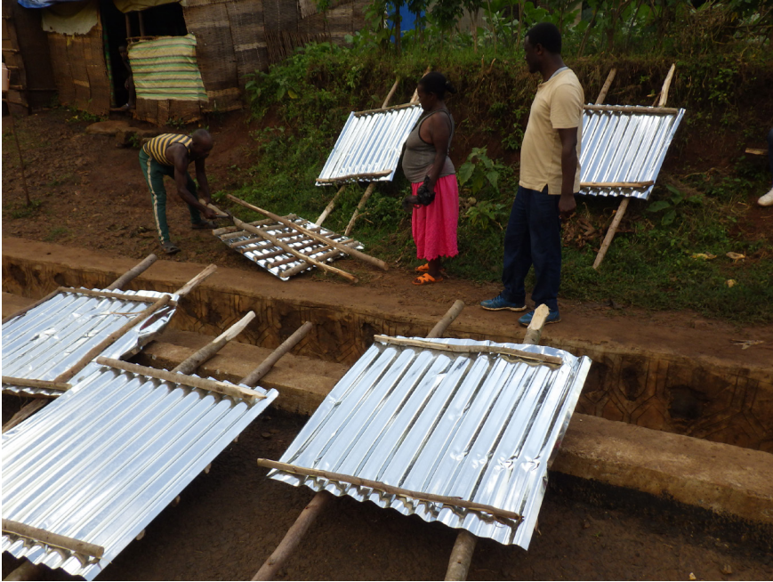
Figure 20. Hand-made Carriers for Scattering the Gravel