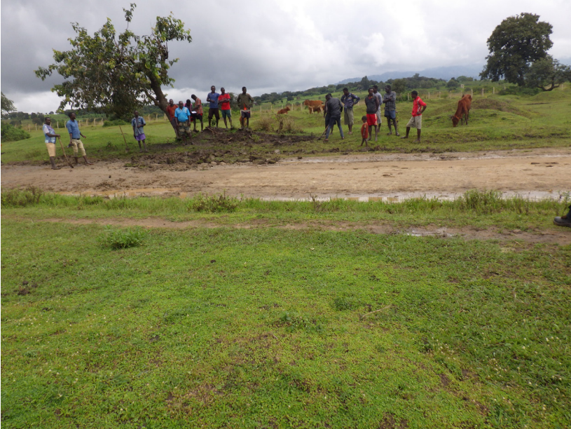
Figure 8. Villagers' Community Work