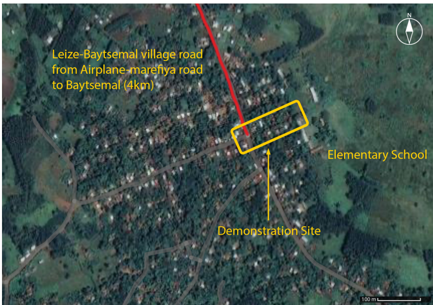
Figure 2. Site Map (close)

(This map was created by authors based on the google maps data.)