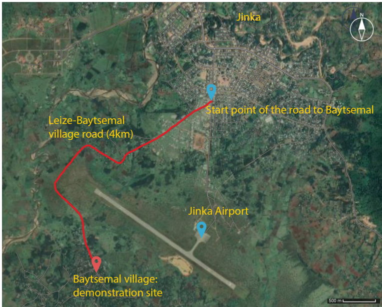
Figure 1. Site Map (wide)

(This map was created by authors based on the google maps data.)