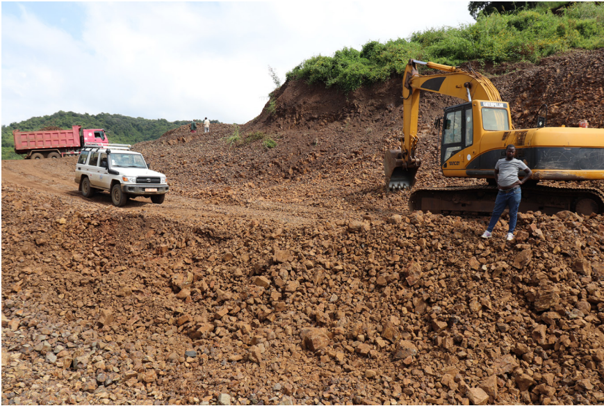
Figure 7. Stone Quarry