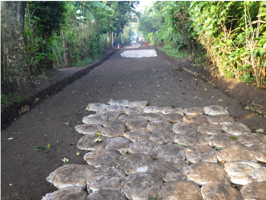
Figure 17. Do-nou Bags Placed in Deep Gullies

It rained heavily in the early morning, making it impossible to transport gravel sand from the Bako Dawla stone quarry. Hence, the villagers had no work. The rain stopped in the afternoon and the gravel was delivered. Two trucks were used to transport 32 m 3 in total (16 m 3 in each truck) (Figure 19). Carriers were fabricated from iron sheets by a local workshop due to the scarcity of wheelbarrows in the town (Figure 20).