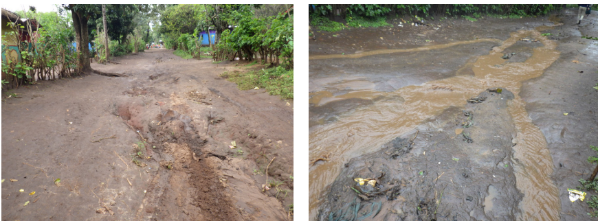
Figure 3. Condition of the Before the Construction

The demonstration site is located at the Baytsemal village in Jinka, South Omo Zone of Southern Ethiopia (Figures 1 and 2). The Baytsemal village is connected to a pavement road, Airplane-marefiya road, by a 4-km-stretch unpaved road called “ Leize-Baytsemal village road. ” Among several options for the demonstration, the team decided on a 100-m stretch of a short path from Leize-Baytsemal village road to a primary school after discussing with the villagers. The path was unpaved and mainly used by school students. Figure 3. shows the condition of the site before the construction. Rainwater from the Leize-Baytsemal village road runs on the surface of the path, causing gullies in the middle of the path.