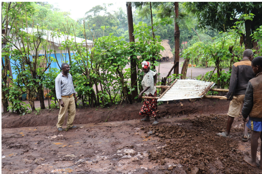
Figure 21. Gravel Pavement (1)