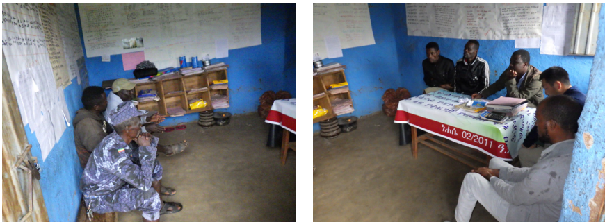
Figure 5. Meeting at the Village Office

The TVET Jinka office provided the needed total station as requested by the project team and two technicians. The items were picked up by the project team at the TVET Jinka office after the meeting at the village office. Afterward, they returned to the site and surveyed the longitudinal gradient and the cross-section at 10-m intervals.