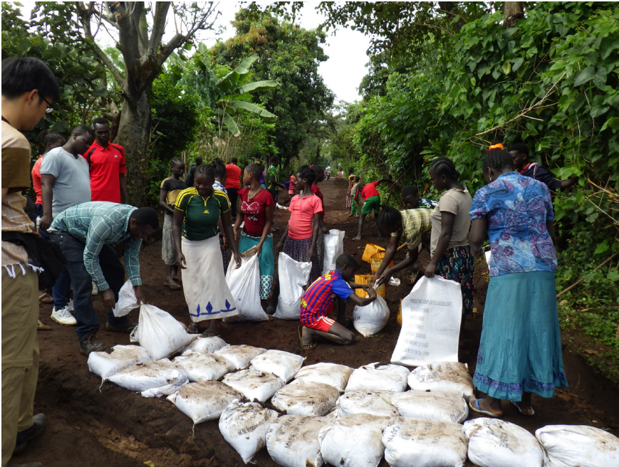
Figure 16. Villagers Putting the Do-nou Bags in Deep Gullies