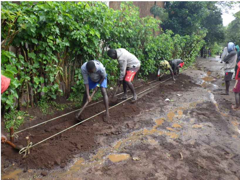
Figure 12. Villagers Excavating the Drainage