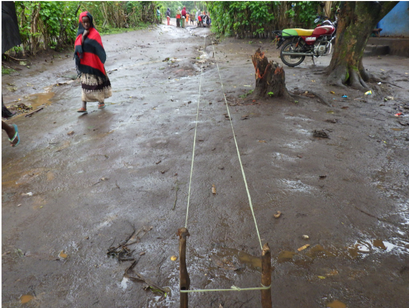
Figure 11. Drainage Excavation Preparation The Yellow String Indicates the Drainage Location