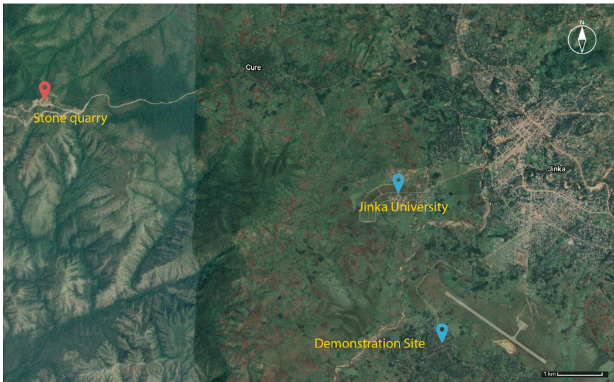
Figure 6. Stone Quarry Location

In the afternoon, the project team and the LC purchased the construction tools, besides hoes and shovels, around Jinka town. Also, they went to a stone quarry (managed by a Bako Dawla woreda office), which was 12 km away from Baytsema, to select the gravel sand needed for the construction (Figures 6 and 7). They determined the required type of gravel sand, negotiated the transportation cost with the owner, and made a deal.