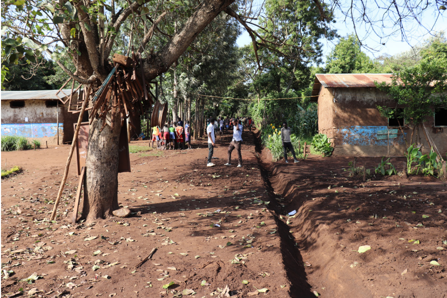
Figure 18. Drainage Continues into the School