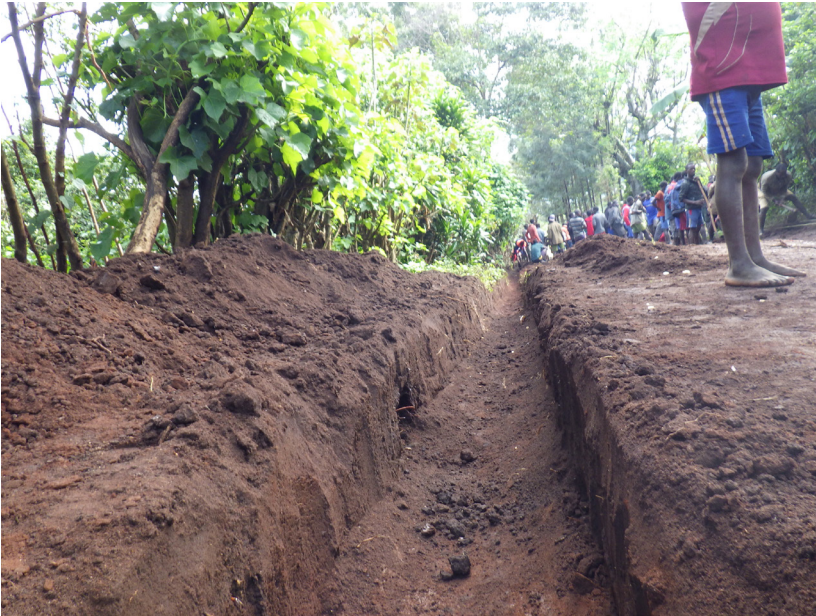
Figure 13. Excavated Drainage