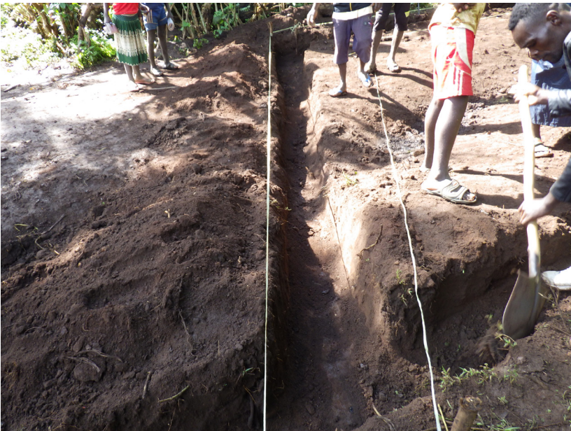
Figure 14. Crossing Drainage in Front of the Primary School Gate