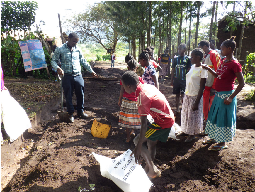
Figure 15. Villagers Putting Excavated Soil into the Do-nou Bags

The excavated soil from the trench was put into Do-nou bags and used to level the gullies (Figures 15 and 16), by laying them in the gullies and compacting them using local compactors. The team expected that the leveling by Do-nou bags would be completed in one day, however, the villagers engaged in the work for just 1 h and completed only 30 m of the 100-m work.