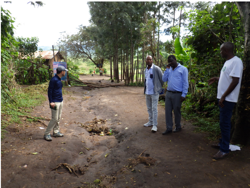
Figure 4. Discussion at the Site

In the afternoon, the project team visited the Technical and Vocational Education and Training (TVET) institutional office in Jinka with the LC to consult on the construction survey and request a set of the total station for the project. The TVET office agreed with the idea and promised to provide a “total station” on the following day.