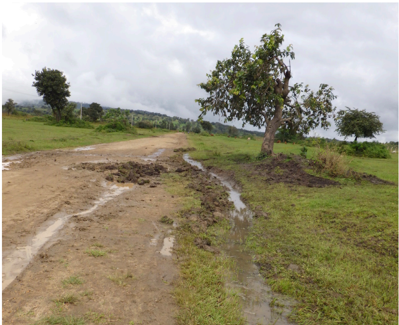
Figure 9. Mud Excavated from the Drainage onto the Main Surface