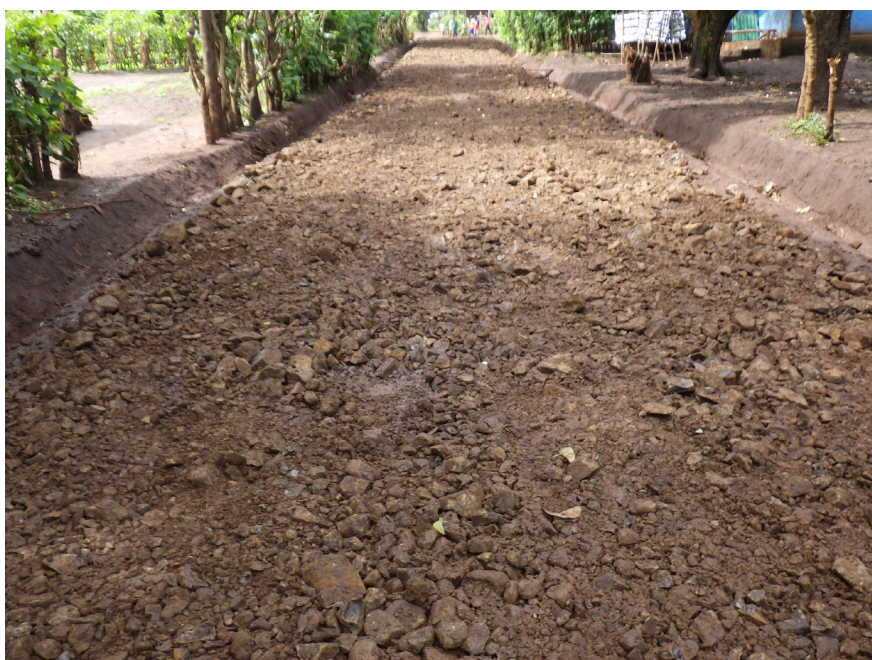
Figure 22. Gravel Pavement (2)