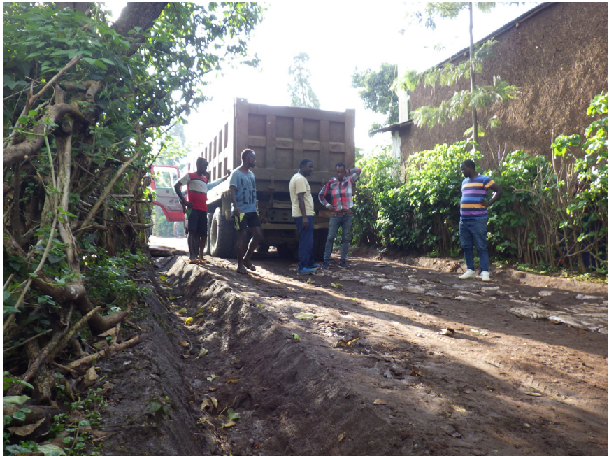
Figure 19. Trucks Arriving at the Site