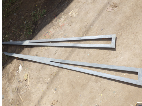
Figure 10. Hand-made Templates and Compactors