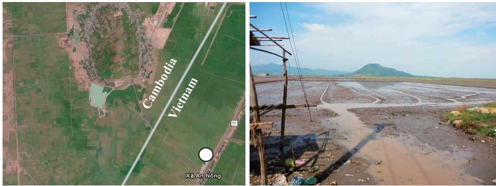
Fig. 2 Landscape of the Vietnam-Cambodia Borderland Visible from Tinh Bien District, An Giang Province Sources: Left: Satellite photo obtained from DigitalGlobe, Earthstar Geographics | NOSTRA, Esri, HERE, Garmin, METI/NASA, USGS. Right: Photograph looking toward the Vietnam-Cambodia border taken by the author at the location of the white spot in the photograph on the left.

bodia, near the Vietnam-Cambodia border, by local bus ( xe đò ) and collected pictures of deceased people by going door to door. Without a passport, he crossed the border either near Cam Mountain in Tinh Bien District or Sam Mountain in Chau Doc city in An Giang Province (see Fig. 1). His maternal uncle had migrated to Cambodia in the 1980s and worked as a goldsmith in Takeo Province. 25) Con stayed at his uncle's house.