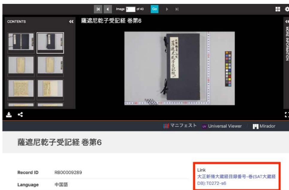
Figure 2. Links to the SAT Daizōkyō Database from a bibliography page on the Kyoto University Rare Materials Digital Archive.

The links are generated based on metadata that have been provided by researchers on the IIF Manifests for Buddhist Studies. 18 The IIF Manifests for Buddhist Studies is a platform that collects 8,133 IIF manifests (the number as of May 24, 2020) regarding Buddhist study material from different institutions around the world. A IIF Manifest is a resource defined by the IIF Presentation API and corresponds to one piece of material. In the field of Buddhist studies, it has long been the practice to assign catalog numbers to each piece of material so that different versions can be compared. The platform enables researchers to register IIF manifests of material related to Buddhist studies. In addition, the platform encourages researches to browse images of the material and add catalog numbers, volume numbers, and line numbers to images. This added metadata is delivered to the SAT Daizōkyō Database and is used to generate reciprocal links between the SAT Daizōkyō Database and bibliography pages in the digital archive.